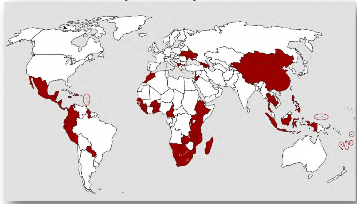
Figure 1. Peace Corps Countries

As of September 30, 2013, the Peace Corps had active programs in 65 countries that were administered through 61 overseas posts (Figure 1 provides a graphic representation of where Peace Corps Volunteers currently serve). Posts are organized into three regions: Africa; Europe, Mediterranean, and Asia; and Inter-America and Pacific.