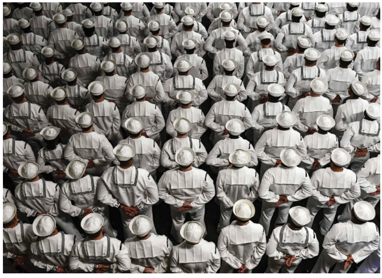
U.S. Sailors stand at parade rest during a Change of Command ceremony aboard the amphibious assault ship USS Wasp in Subic Bay, Philippines.