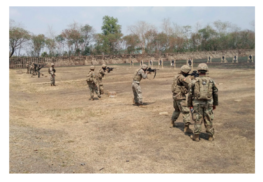
U.S. and Philippine soldiers hone their marksmanship skills at a range during Exercise Salaknib.

The DoS Bureau of Diplomatic Security, Bureau of Counterterrorism and Countering Violent Extremism, and U.S. Embassy Manila conducted 10 training courses with Philippine partners this quarter and has 23 planned for next quarter, according to the DoS. Courses conducted in the Philippines this quarter included crisis response and critical infrastructure, airport, and bus and rail system security. This training, provided through the DoS Anti-Terrorism Assistance program, was primarily directed toward the PNP's special security operations units, the Special Action Force.<sup>73</sup>