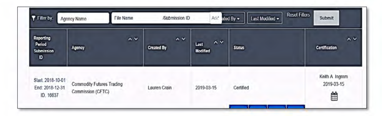
Illustration 2. CFTC's FY 2019 Q1 Submission to DATA Broker