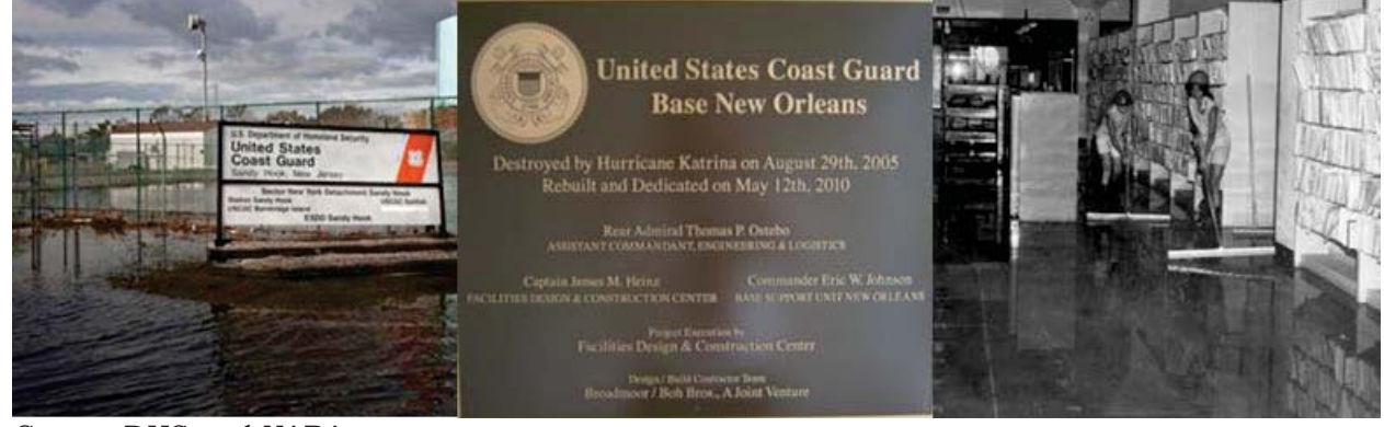
Figure 6. Examples of Flood Damage to Facilities and Records

USCG still has not completed contingency planning for hard copy health records even though one clinic was destroyed during Hurricane Katrina in August 2005. Without complete contingency planning, the USCG has not fully minimized the risks of losing privacy data in a disaster. For example, figure 6 shows how flooding can damage facilities and records.