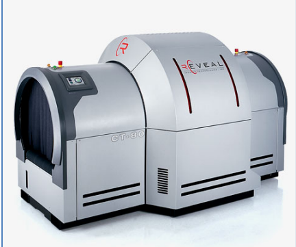
Reveal CT-80DR EDS

The different types and levels of maintenance are defined in the maintenance contracts. As part of routine preventive maintenance, contracted technicians are to perform specific maintenance actions according to contractual requirements and manufacturer specifications. According to the maintenance