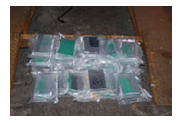
77 pounds of cocaine discovered in an outbound vehicle, 29 year old Canadian female arrested.

Robbyn Blankinship, 29, a Canadian citizen who resides in Vancouver, British Columbia, was arrested at the port. The cocaine has an estimated street value of over $1 million.