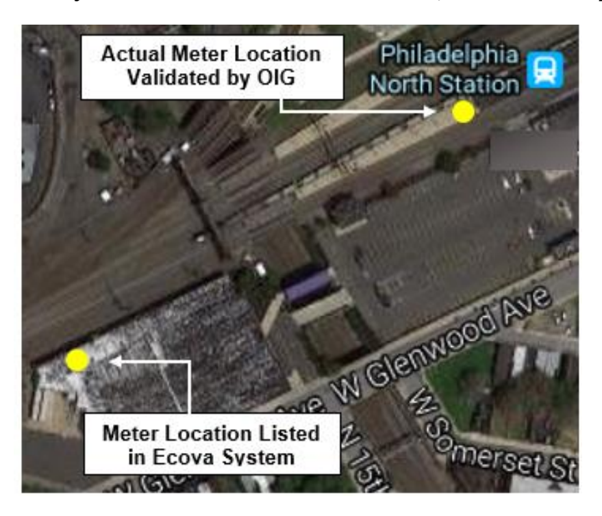
Figure 2. Comparison of a Meter Location Listed in the Ecova Utilities Management System to the Actual Meter Location, North Philadelphia