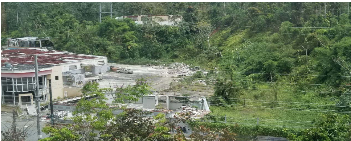
Figure 1. Puerto Rico after Hurricane Maria

On September 18, 2017, the President approved an emergency declaration for Puerto Rico. On September 20, 2017, Hurricane Maria made landfall. It was the strongest hurricane to make landfall in Puerto Rico since 1928. Hurricane Maria's powerful winds and heavy rainfall damaged communication and power grids, destroyed homes, and downed trees leaving Puerto Rico's 3.7 million people without power or communication. Almost 4 months after the hurricane made landfall, approximately 45 percent of the power company's customers were still without power.