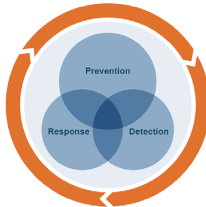
Figure 2: Interdependent and Mutually Reinforcing Categories of Fraud Control Activities

Source: A Framework for Managing Fraud Risks in Federal Programs, GAO-15-593P, July 2015