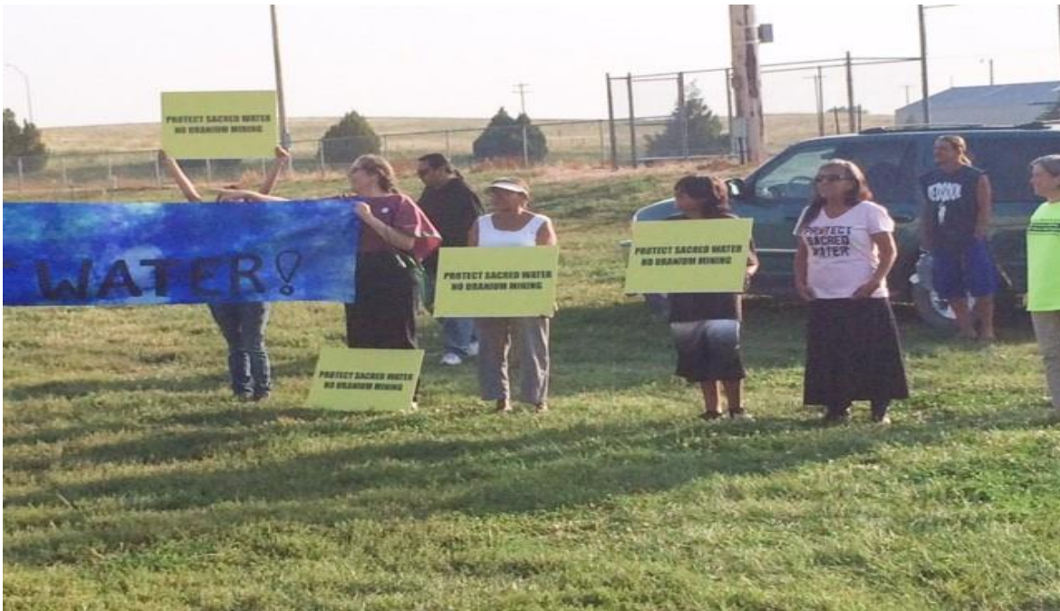
Photo: Oglala Sioux Tribal Members Protesting a Uranium Recovery License Renewal

While there are no assurances that effective Tribal outreach and consultation would prevent lawsuits, there is a higher probability that NRC could avoid Tribal lawsuits with productive communications and strong relationships with Tribes. Additionally, lawsuits negatively affect applicants due to the associated project delays and additional costs. Therefore, ensuring that NRC conducts proper Tribal outreach and establishes relationships with Tribes is vitally important.