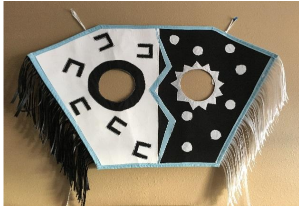
Standing Rock Sioux Horse Mask