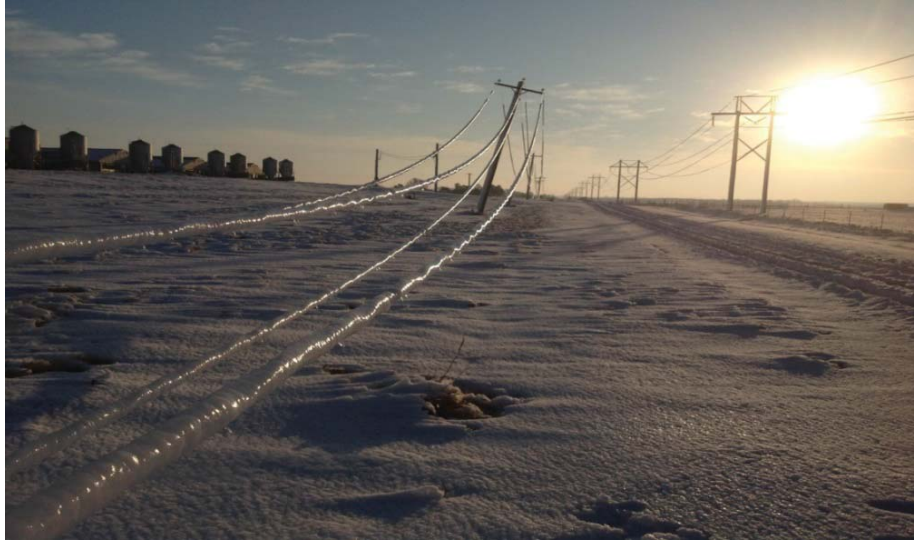
Figure 1: Damaged Electrical Lines, Blaine County, Oklahoma