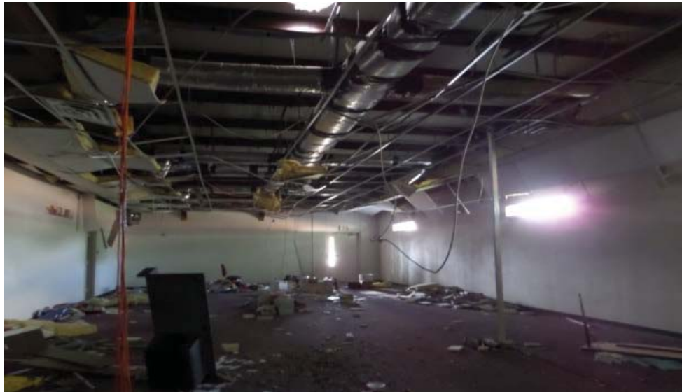
Figure 2: West Middle School Annex Building