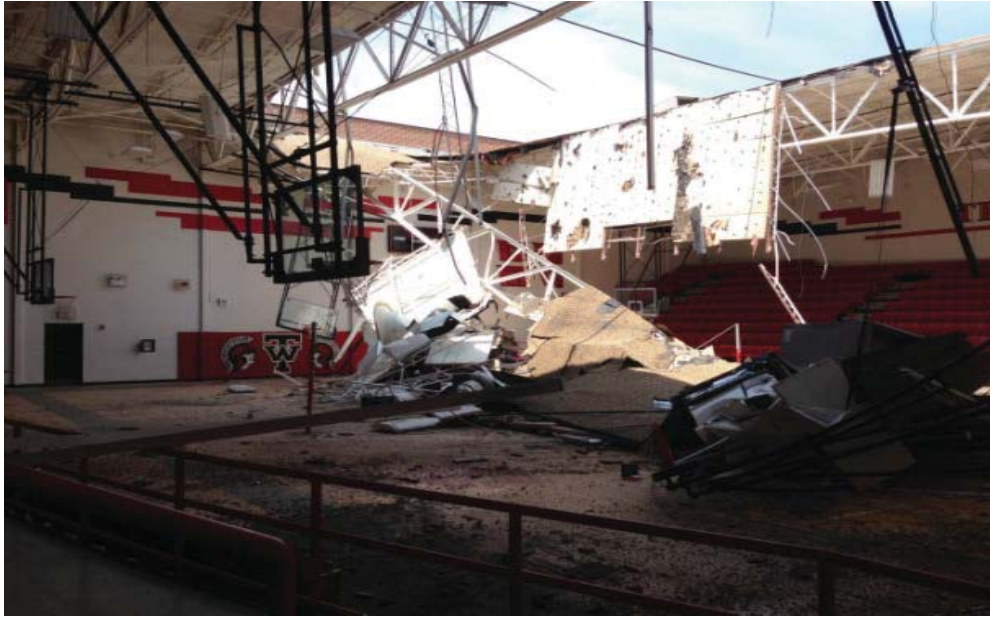
Figure 1: West High School Gymnasium

Source: School District's structural report dated May 15, 2013