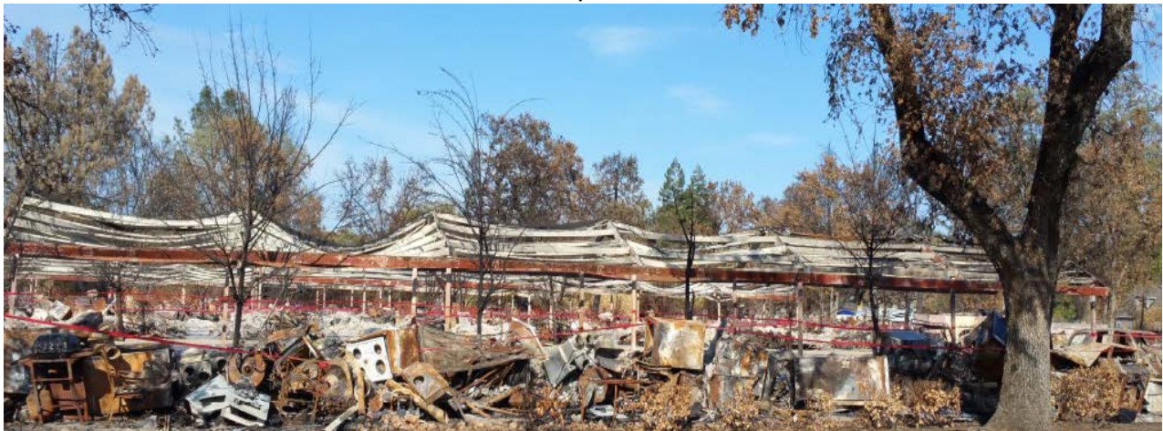
Figure 1: Residential Complex Damaged By Valley Fire Middletown, California