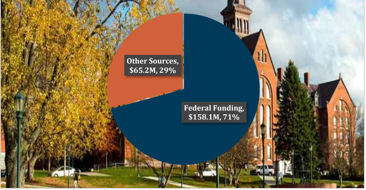
Figure 1: UVM's FY 2022 Government Grants and Contracts

NSF OIG engaged Cotton & Company Assurance and Advisory, LLC (herein referred to as "we"), to conduct a performance audit of costs claimed by the University of Vermont and State Agricultural College (UVM). UVM is a public, nonprofit, comprehensive research institution of higher education located in Burlington, Vermont. In fiscal year (FY) 2022, UVM reported approximately $223.3 million in government grants and contracts, with $158.1 million received from federal sources—including NSF—as illustrated in Figure 1.