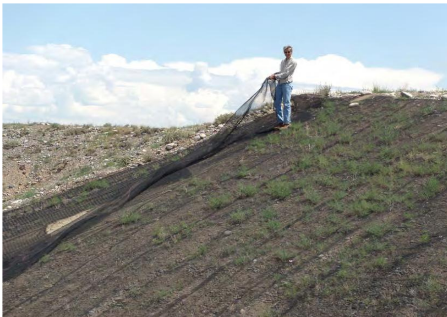
Loose erosion fabric at the Shiprock uranium mill tailings site in New Mexico

is not practicable with available remediation techniques, a licensee may apply for approval of alternative standards known as alternate concentration limits (ACLs) for one or more contaminants.