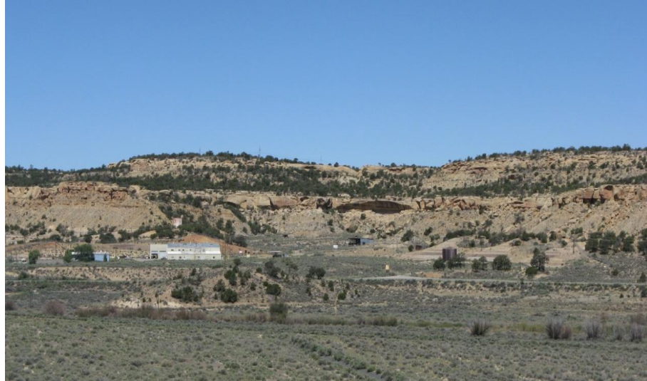
The Church Rock uranium mill tailings site in Gallup, NM

of understanding (MOUs) regarding oversight of two sites. The MOUs outline EPA and NRC obligations to coordinate distinct regulatory responsibilities.