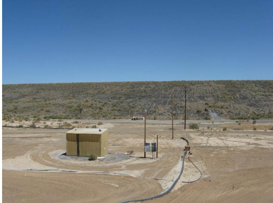
The Homestake uranium mill tailings site in Grants, NM

NRC has several obligations under the MOUs. One is to provide site remediation progress reports on a quarterly basis for Church Rock and on a semiannual basis for Homestake. Another responsibility is to conduct an annual review of the MOUs. These two responsibilities are part of several conditions in the MOUs intended to ensure long-term effectiveness of oversight and promote mutual communication.