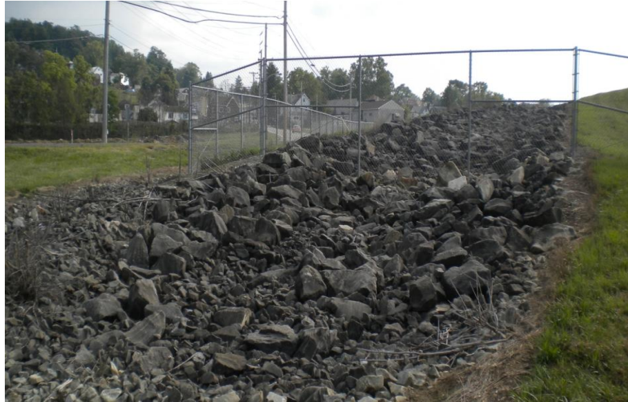
A decommissioned Title I uranium mill tailings site in Canonsburg, PA

maintenance under a general license from NRC. As of June 2011, decommissioning had been completed at 21 Title I sites.