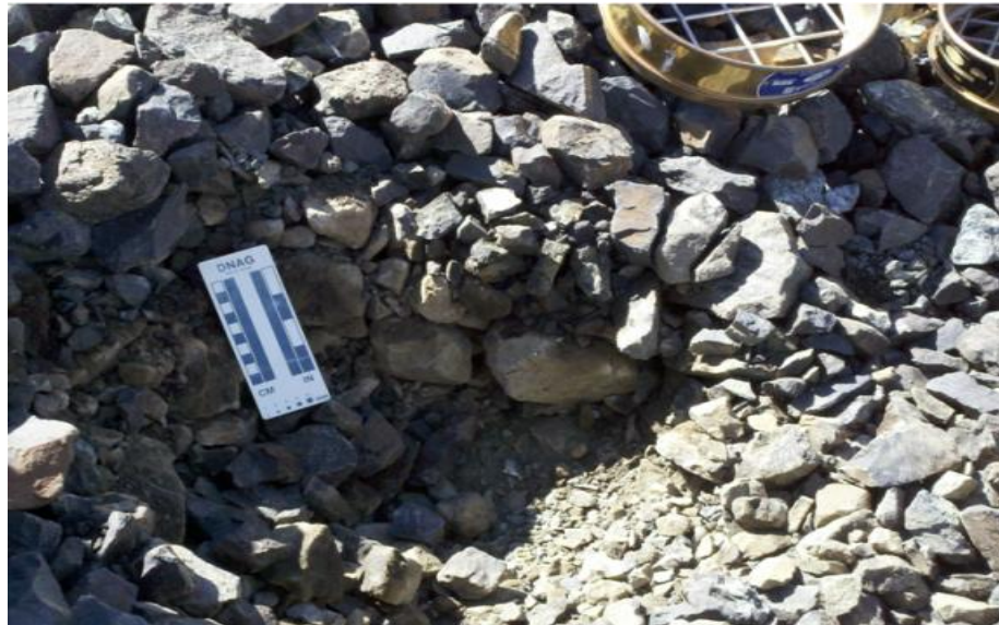
Rock cover testing at the Umetco uranium mill tailings site in Gas Hills, WY

NRC relies on DOE's inspection program at decommissioned uranium recovery sites in DOE custody. Although inspections are a key component of NRC's oversight, NRC has chosen not to inspect the sites transferred to DOE. As a result, NRC may not know if all regulatory requirements are met regarding the protection of public health and safety and the environment.