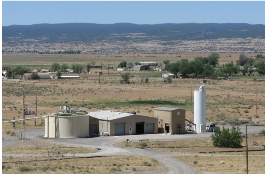
A water treatment plant at the Homestake site in Grants, NM

NRC does not fully comply with the MOUs for uranium recovery CERCLA sites because NRC does not have internal controls or performance measures in place to provide reasonable assurance that NRC is fulfilling its obligations.