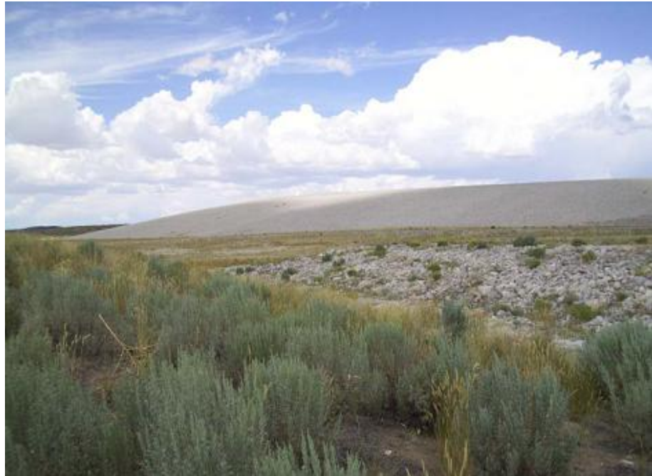
The Maybell West uranium mill tailings site in Colorado

Project managers in FSME described their oversight activities as reviewing the DOE-submitted inspection reports and groundwater monitoring reports where applicable. They may follow up with DOE's Office of Legacy Management if they have a question, but the primary contacts with DOE staff are in quarterly conference calls to review technical issues. Project managers sometimes visit the sites in DOE custody, but they clearly stated that such visits are not formal inspections. For example, one project manager reported recently touring a few sites in order to become more familiar with site-specific issues.