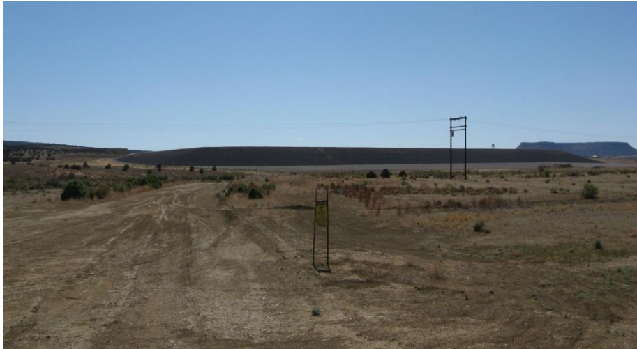
The Rio Algom uranium mill tailings site in Grants, NM

As part of its mission, NRC regulates uranium recovery operations. Through the 1980s, commercial uranium recovery mills operated in support of both a fledgling nuclear power industry and U.S. defense programs. The waste from the mills (uranium mill tailings) caused contamination that the Federal Government continues to address (see Appendix A for additional information on contamination).