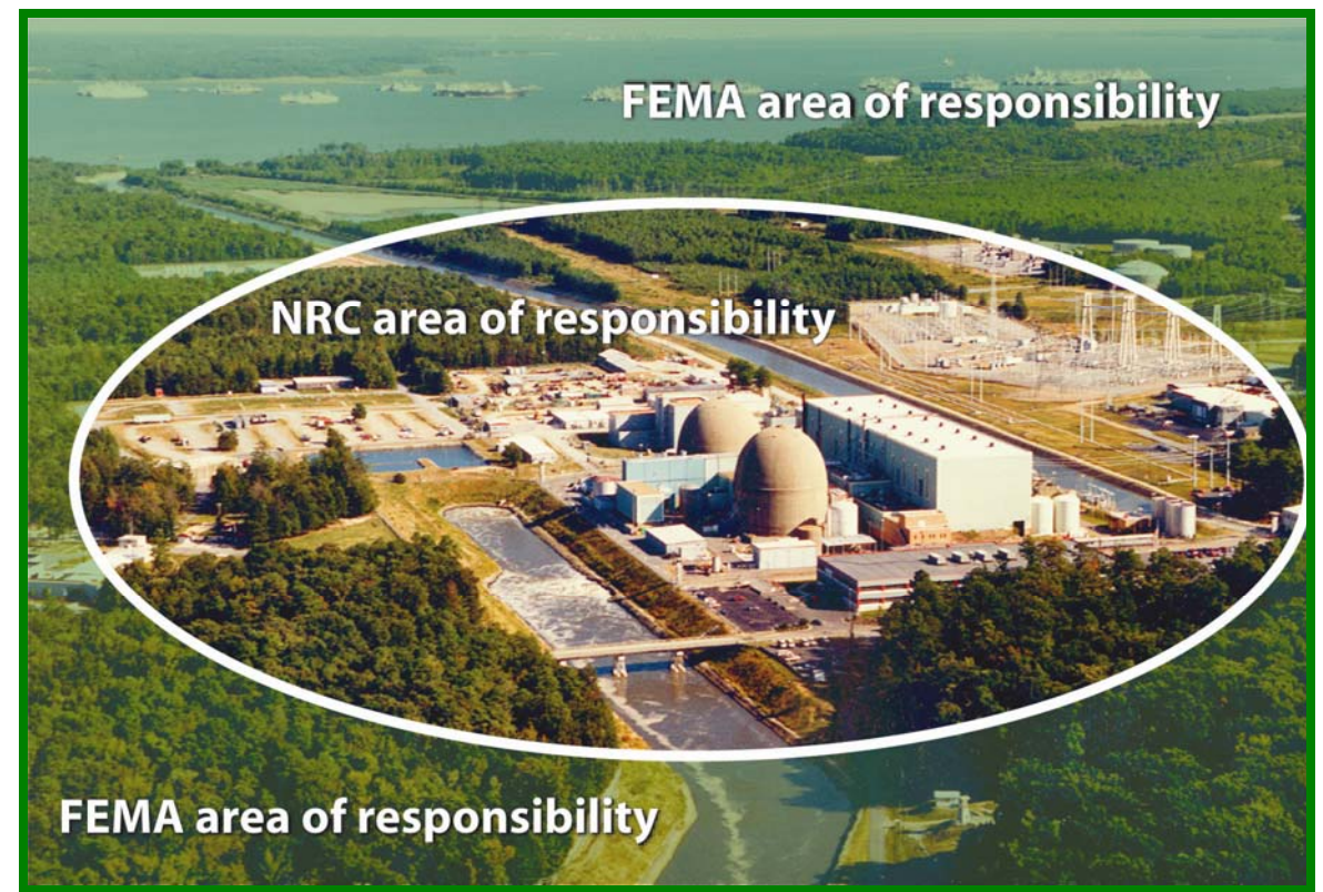
Figure 2: NRC regulates the emergency planning activities within the physical boundaries of nuclear power plant facility perimeters.

During biennial full-participation EP exercises, NRC evaluates licensees implementation of their emergency plans, while FEMA assesses State and local authorities' abilities to carry out offsite emergency plans.