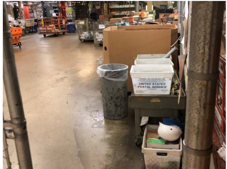
Figure 3. Cluttered Rewrap Area

The box, flat tubs, and hard hat are examples of items that need to be removed from the rewrap area.