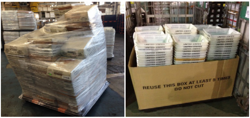
Figure 2. Improperly Prepared MTE

Incorrectly prepared trays and tubs received from processing facilities.