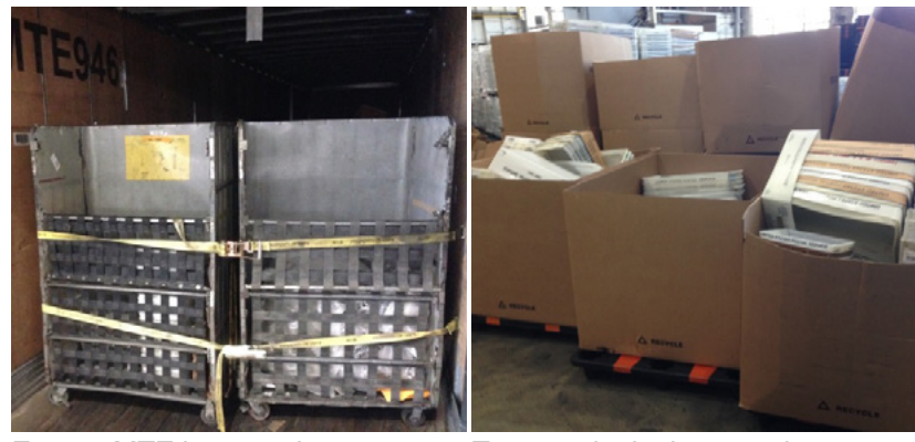
Figure 3. Improperly Containerized MTE

Excess MTE improperly containerized in APCs received at the MTESC.