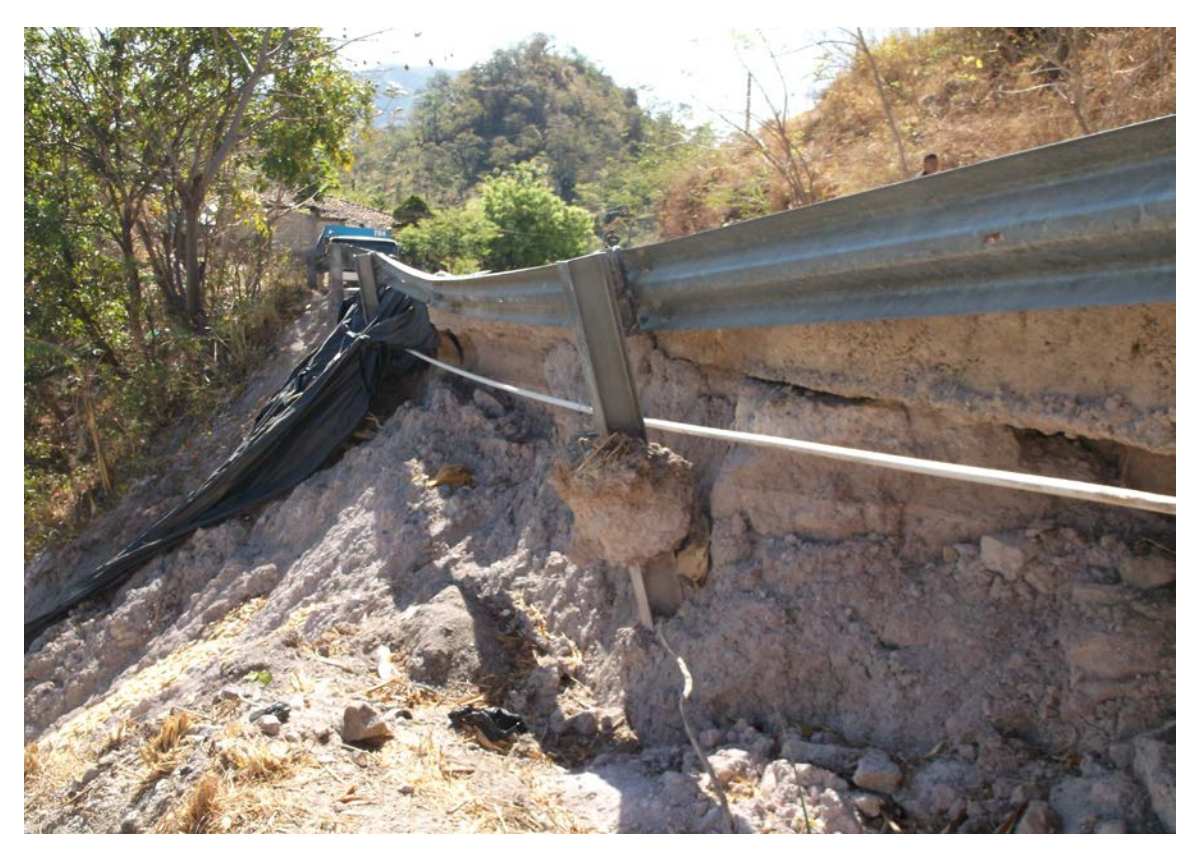
Along Route 3 in El Salvador, an embankment gives way.