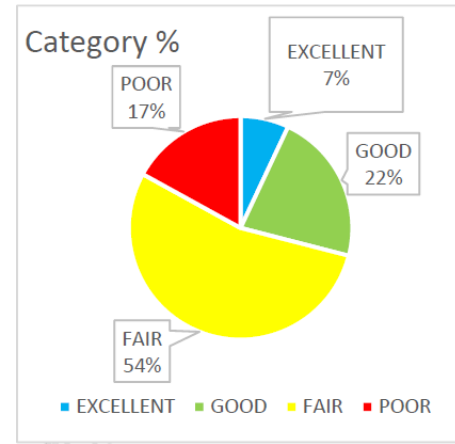
Figure 2: Georgia total kilometers

Likewise, the Lots in Georgia were of unequal lengths and terrains and so Figure 2 is presented for comparison and summary. Georgia roads were assumed to be 6 \frac{1}{2} -years old.