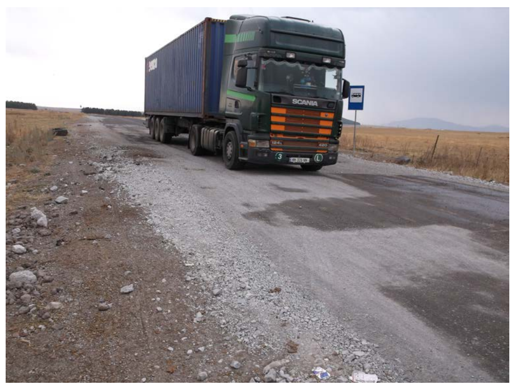
On a road in Georgia near the Armenian border, broken pavement extends almost 13 kilometers. Photo: S. Deppmeier, DOT engineer (September 2017)

Source: Based on U.S. DOT engineers' visual inspections conducted for this audit.