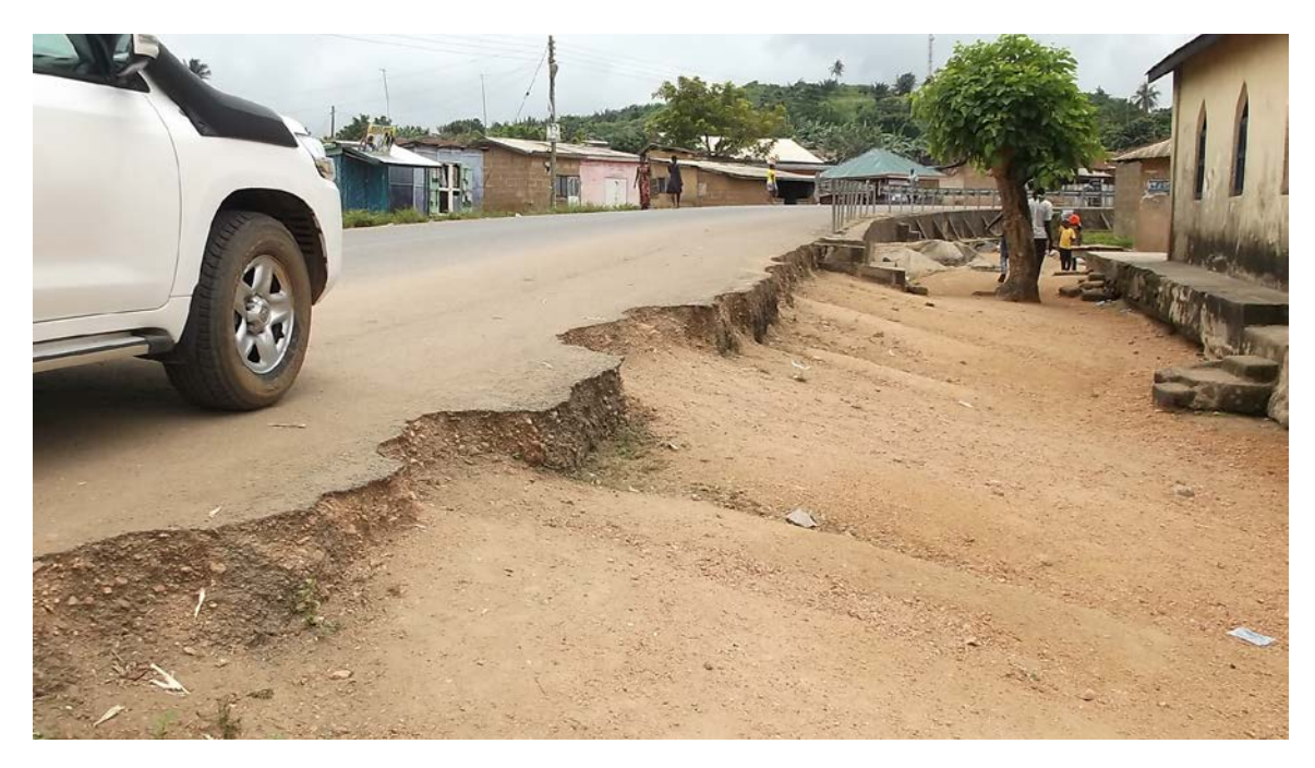
The paved edge of the Awutu-Breku-Bontrase-Obrakyire in Ghana is eroded, creating a drop-off. (September 2017)