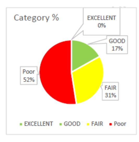
Figure I: Ghana total kilometers

Since the Lots in Ghana were of unequal lengths and of differing terrain and environmental factors, Figure I was created to provide a visual representation of the percentage of total kilometers in their respective condition of either: Excellent, Good, Fair, or Poor.