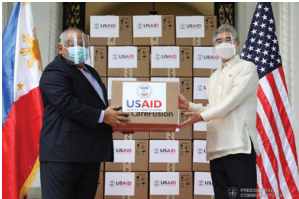
Executive Secretary of the Philippines Salvador Medialdea (left) receives one of the 100 U.S.-donated ventilators from U.S. Ambassador to the Philippines Sung Kim (right).

More broadly, USAID reported that it delivered 100 ventilators to the Philippine government on August 28. 205 This delivery included clinical training sessions and additional medical supplies and consumables that would sustain use for 2- patients per ventilator, depending on use. 206 The recipient hospitals and government entities will assume responsibility for costs associated with maintaining the equipment after the expiration