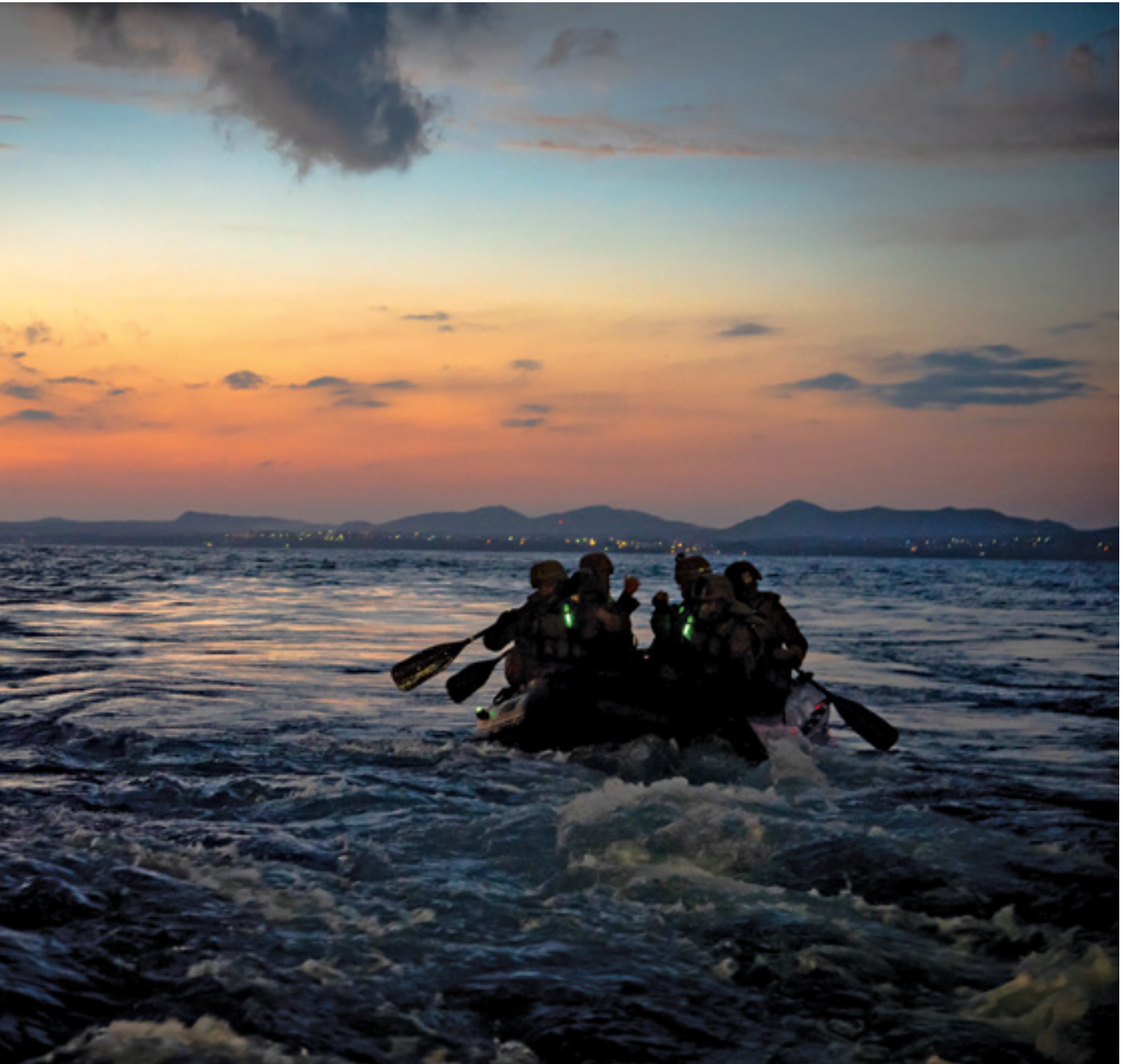
U.S. Marines conduct a boat raid exercise in the Philippine Sea.