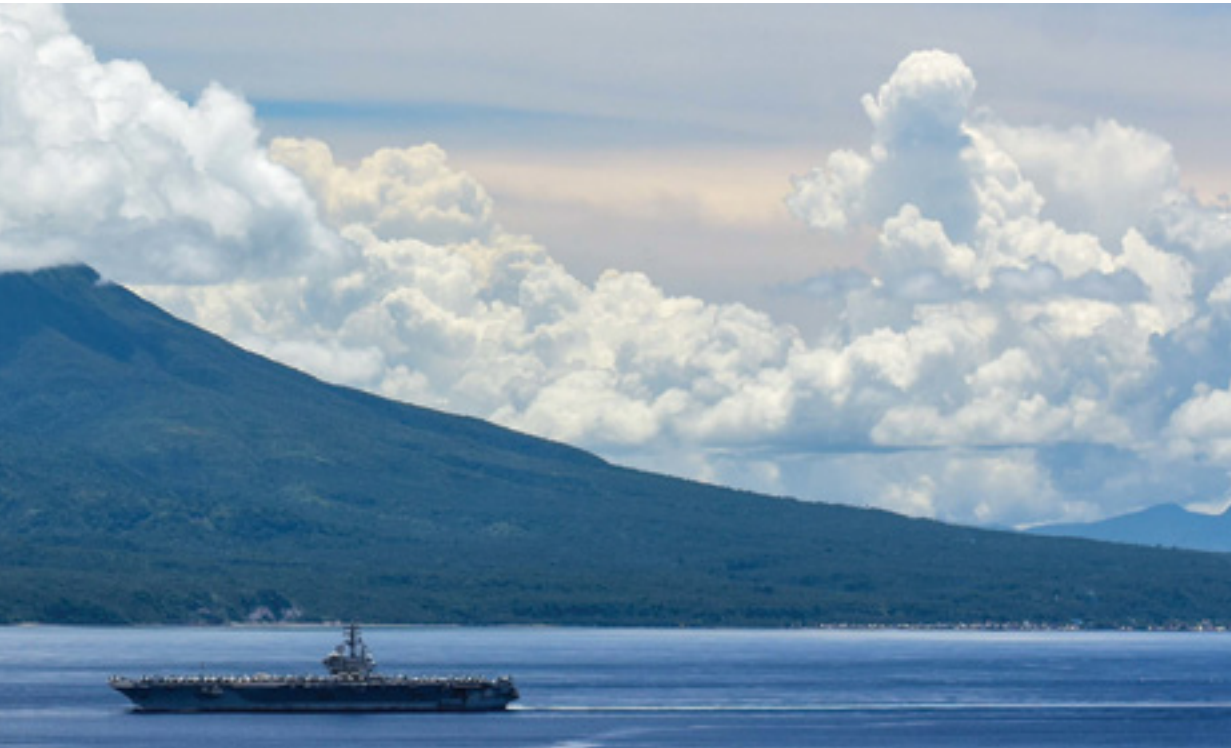
Aircraft carrier USS Ronald Reagan steams through the San Bernardino Strait, crossing from the Philippine Sea into the South China Sea.

report are listed in endnotes or notes to tables and figures. Except in the case of audits, inspections, investigations, and evaluations referenced in this report, the Lead IG agencies have not verified or audited the information collected through open-source research or from Federal agencies, and the information provided represents the view of the source cited in each instance.