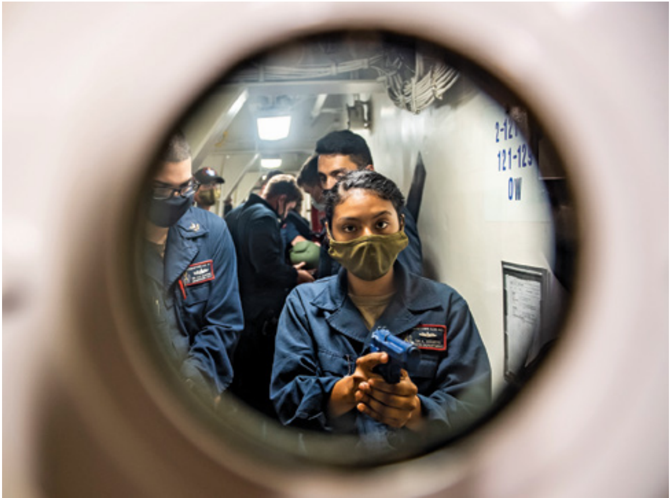
U.S. Sailors participate in an antiterrorism training exercise.