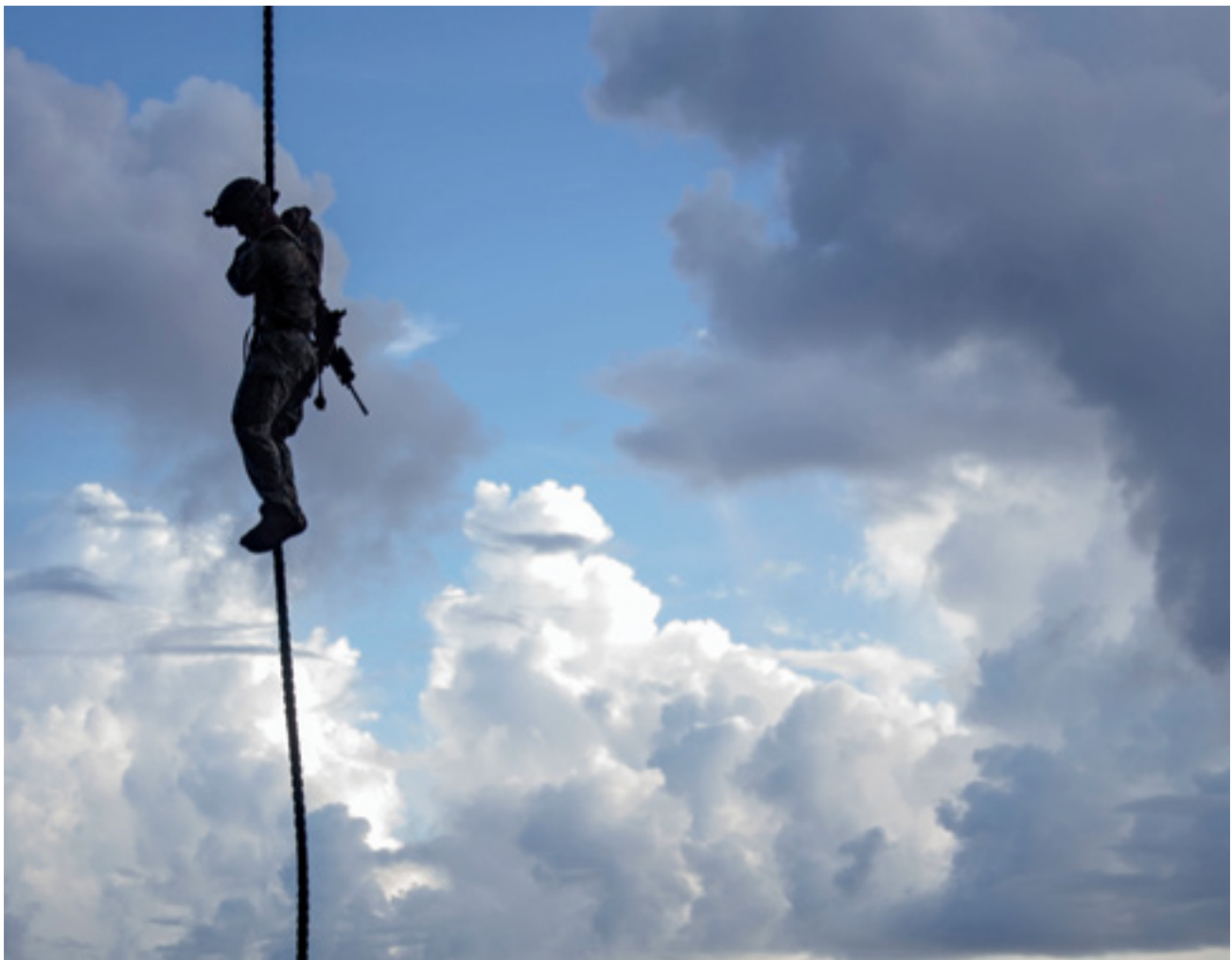
A U.S. Marine fast ropes from an MV-22B Osprey in a training exercise.