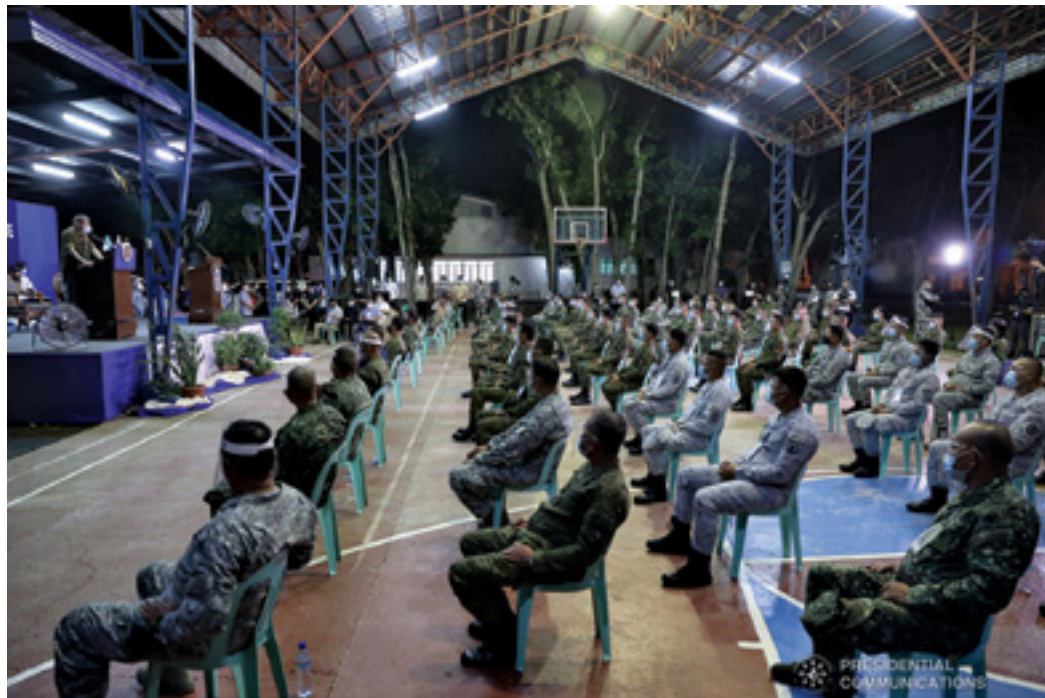
Philippine President Rodrigo Duterte talks to troops at Edwin Andrews Air Base in Zamboanga City.

U.S. special operations forces conducted four subject matter exchanges and assisted two local medical staffs with patient assessments and transfers, according to SOCPAC. 107