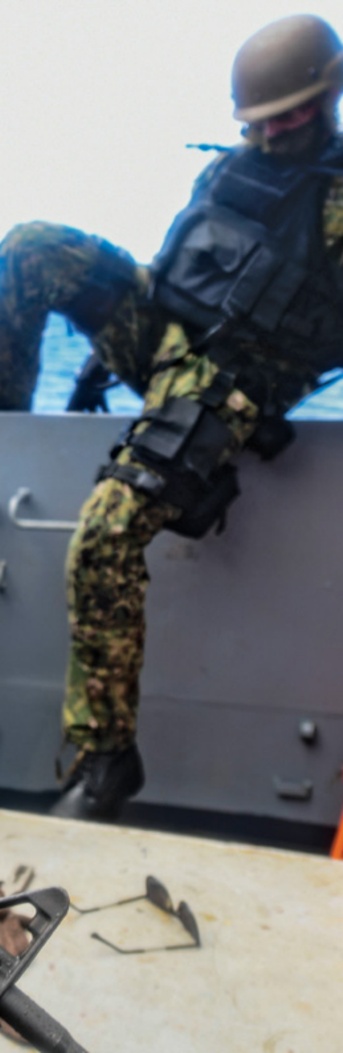
U.S. security forces board a vessel during a training exercise in the Philippine Sea.