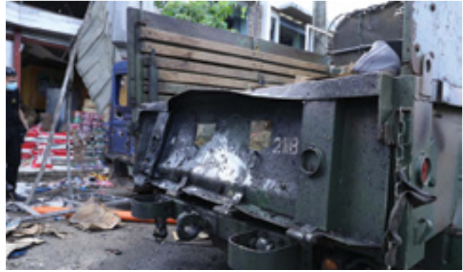
Aftermath of the twin bombings at Barangay Walled City in Jolo, Sulu, on August 24.