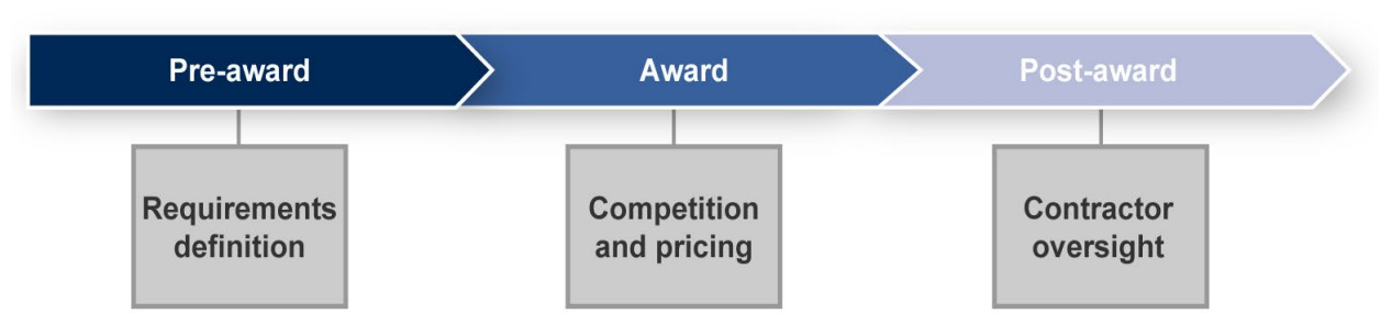
Figure. Contracting Life Cycle