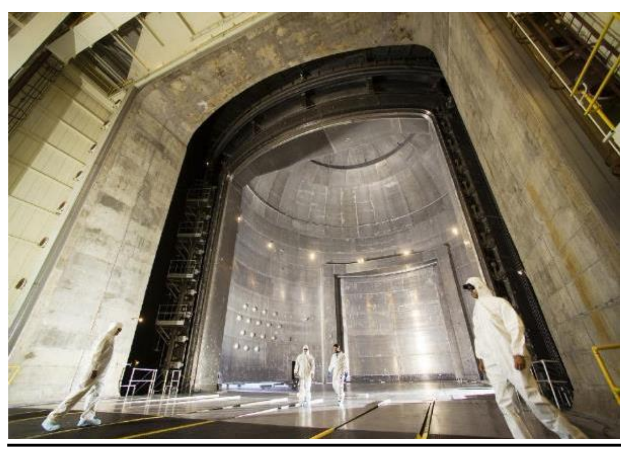
Figure 3: SPF Thermal Vacuum Chamber