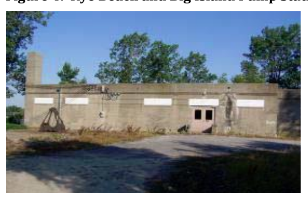
Figure 4: Rve Beach and Big Island Pump Stations

Over the past 10 years, Plum Brook has made progress reducing unneeded facilities. As of August 2014, Plum Brook had demolished more than 65 structures and infrastructure over the past 10 years and has plans for additional demolition, including eventual demolition of the igloos. For example, Plum Brook excessed one pump station – the Rye Beach Pump Station – associated with the now decommissioned nuclear reactor and is in the process of excessing a second – Big Island Pump Station (see Figure 4). The operations and maintenance costs for these stations for the past 3 years totaled approximately $35,500. In 2012, Plum Brook completed demolition of its nuclear reactor, which was permanently shut down in 1973. Prior to its demolition, the reactor building had a total deferred maintenance value of approximately $12.86 million.