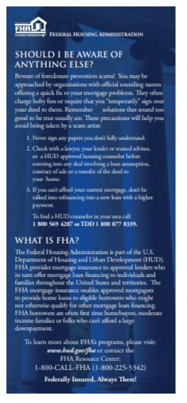
Illustration 4. Save Your Home – Tips to Avoid Foreclosure brochure