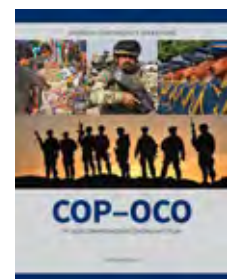
FY 2019 Comprehensive Oversight Plan for Overseas Contingency Operations

This quarter, the Lead IG agencies and their partner agencies completed one report related to OPE-P. As of December 31, 2018, four oversight projects were ongoing, and two were planned. Table 2 lists the project titles and objectives for the ongoing projects, and Table 3 lists the project titles and objectives for the planned projects.