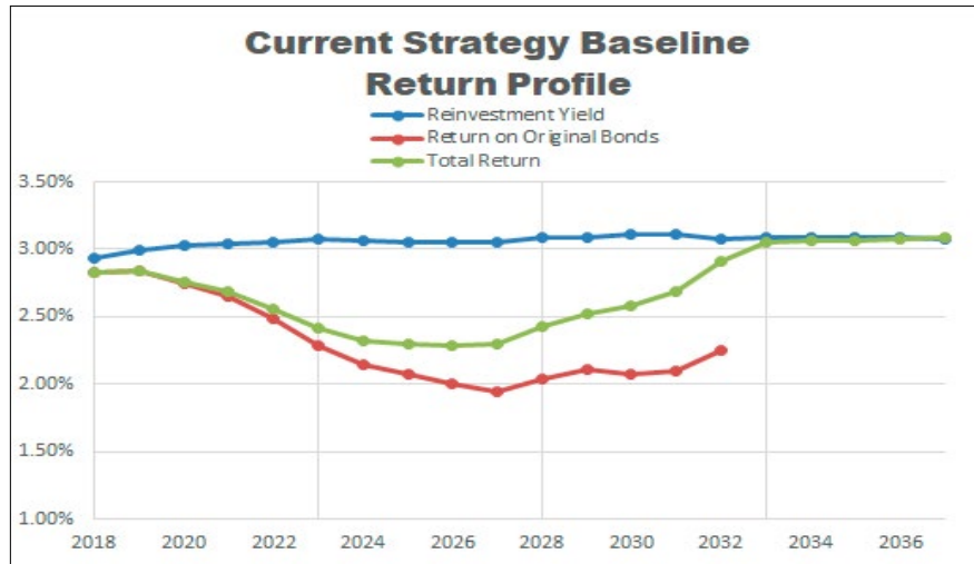
Figure 1. Current Strategy Baseline Return Profile

For example, Figure 1 shows the potential effects of the laddering of the Postal Service’s CSRDF. Assuming an investment yield of 3.1 percent on future cash flows and scheduled maturities in each year after FY 2018 (blue line), the current yields (red line) and maturity structure do not prevent the returns on the CSRDF (green line) from falling further, through 2024, before increasing only gradually, reaching about 3.1 percent in 2033.