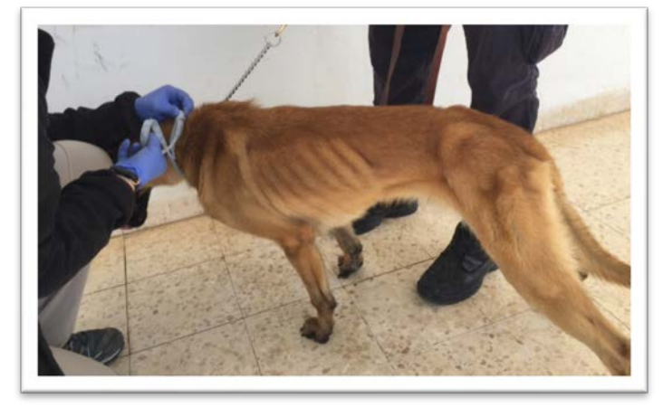
Figure 2: Underweight Jordan canine.

veterinary team, many of the canines suffered from engorged ticks, which means the ticks were likely on the dogs for several days. See figure 3 below. The Army Field Manual notes that the military working dogs are at risk of becoming infested with external parasites (fleas, ticks, and mange), which may transmit infectious diseases to the dogs. Dogs housed in kennel settings with poor tick control are at a higher risk for developing parasite-transmitted diseases. The manual states that all canines "must be on a routine parasite prevention program supervised by the responsible veterinarian." The Army Pamphlet notes that "grooming and inspection are essential to the dog's health and well-being, and must be done daily." One of the DS/ATA mentors in Jordan told OIG that after the veterinary team visit in April 2018, the handlers are more consistently performing daily checks for ticks.