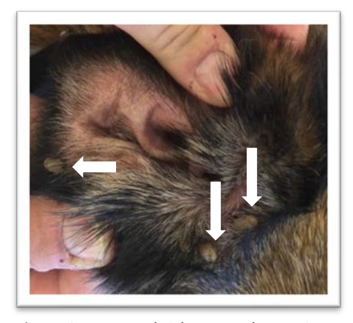
Figure 3: Engorged ticks on Jordan canine ear.

OIG spoke to five veterinarians who currently work or previously worked for CVC during the time period of this review, and all of them expressed concern with the health and welfare of the canines in Jordan. For example, one veterinarian stated that on-the-ground oversight should be required for Jordan or the canines would not receive proper care. Another veterinarian told OIG that the program in Jordan should have been shut down because of how badly the dogs were treated, but that the next best thing was to put U.S. veterinarians in the country to try to improve their care. In November 2018, a full-time, Department-funded veterinary team arrived in Jordan.