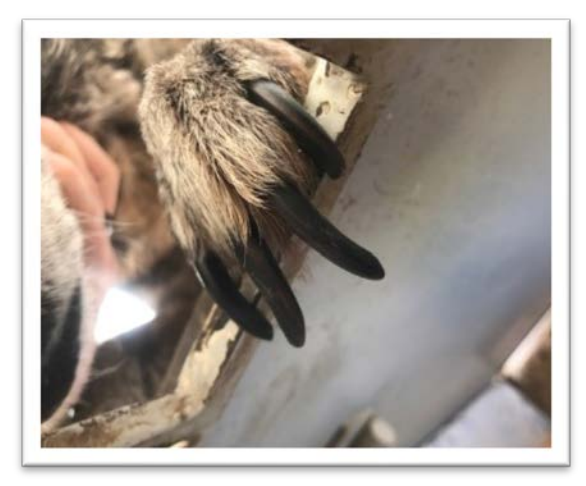
Figure 7: Underweight canine in Jordan (left); Jordan canine needing nail trim (right).

Therefore, OIG remains concerned that Jordan is not able or willing to provide adequate care for working dogs without the Department's intervention and that any improvements that have been made were simply a reaction to pressure from DS/ATA. This concern is compounded by the fact that the Department does not have a plan in place to ensure that the Jordan program can reach self-sustainment. In both July 2016 and August 2018, the Department provided more canines to Jordan, even though concerns had recently been raised as to whether its officials could sufficiently care for them. Moreover, rather than taking a systemic approach toward the concerns identified, the Department has instead attempted to address situations on what appears to be an ad hoc basis. There is no guarantee that the Department's substantial assistance to address specific incidents will continue, yet the Department has conducted minimal planning to ensure that Jordanian officials can maintain the health and welfare of the dogs for the duration of their lives.