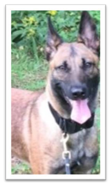
Figure 4: Zoe prior to her deployment to Jordan.

underweight. The situations surrounding these three canines are described in more detail below. OIG has focused on these three cases because there was clear evidence of both the health concerns of the individual dogs and the consequences.