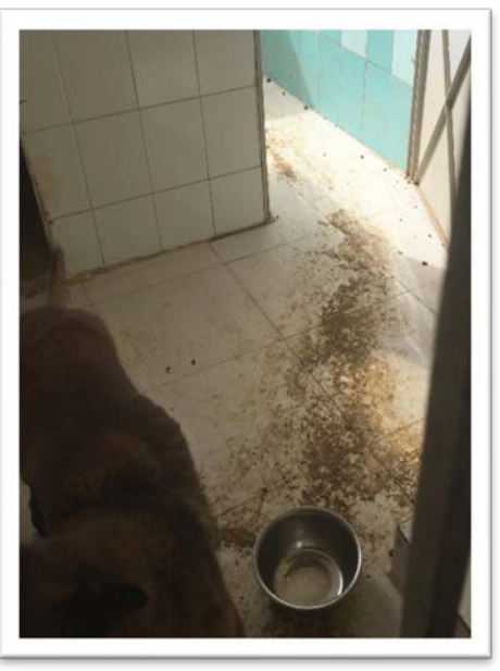
Figure 6: Athena appears severely emaciated after less than 1 year in Jordan (left); Athena's kennel with dirt and feces on the floor and no water in her bowl (right).

Source: CVC photos taken in Jordan in April 2018.