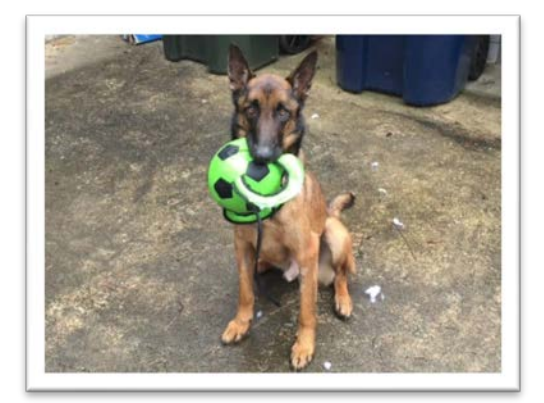
Figure 5: Mencey back from Jordan.

Zoe was a 2-year-old female Belgian Malinois that arrived in Jordan in October 2016 and died of hyperthermia (heat stroke) in July 2017 while working at the Syrian border. According to one of the DS/ATA mentors in Jordan, Zoe's death was at least partly due to the canine being reassigned to a handler who had not been trained at CVC. A CVC veterinarian told OIG that heat injuries are cases of negligence and improper care and are not accidental. Additionally, the veterinarian told OIG that canines with hyperthermia suffer a terrible death and that heat-related injuries are a significant concern for any canines going to the Middle East. The death of Zoe led to additional training on heat-related injuries in the Jordan handler courses held at CVC. The DS/ATA mentors in Jordan also developed a presentation on the signs of hyperthermia and preventative measures following Zoe's death. The Army's military working dog standards caution that canines are especially vulnerable to hyperthermia during hot or humid weather. 32 The Army standards list symptoms of hyperthermia and the guidelines to follow at the onset of symptoms, but as noted above, the military working dog or similar standards were not employed once the canines were provided to Jordan.