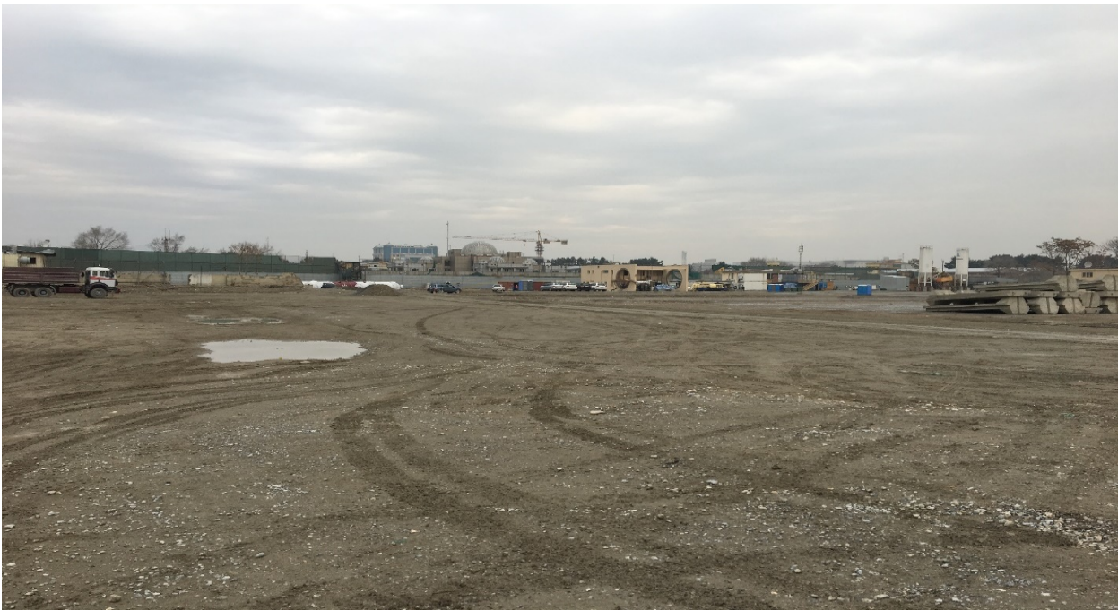
Source: OIG photo of Camp Eggers taken February 26, 2018.