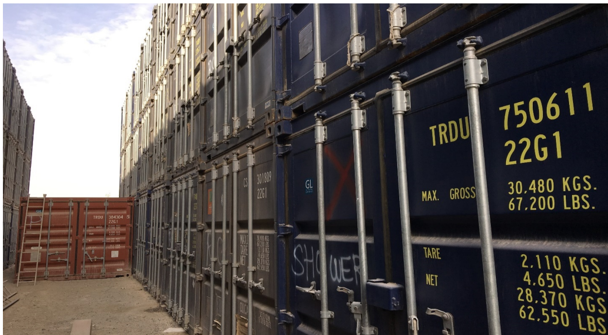
Source: OIG photo of empty CHU containers taken in Dubai, U.A.E. on February 22, 2018.

Red Sea Housing Services Company FZE (Red Sea), the company that manufactured the CHUs, eventually started CHU production on Aegis's behalf on August 18, 2015. According to Red Sea officials, Aegis provided it with a Notice to Proceed (NTP) to purchase containers, but it never received an official contract to perform the work. Nonetheless, Red Sea purchased 520 containers, as shown below, and other CHU building materials at a cost to the Department of about $2.6 million.