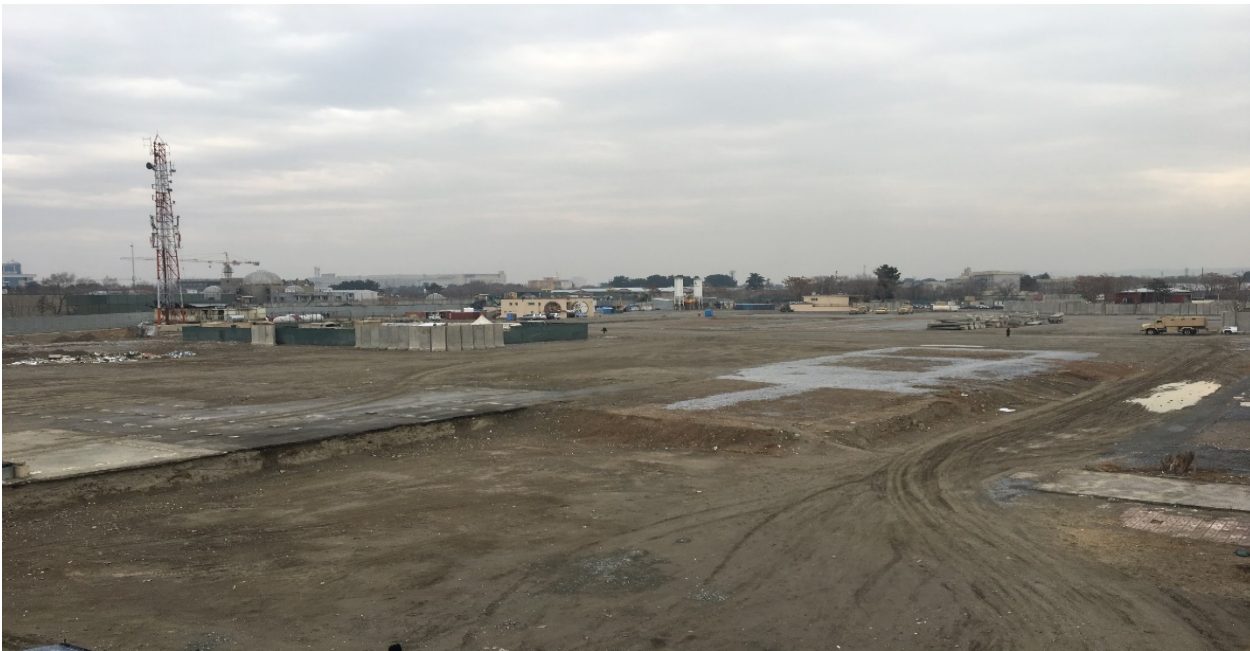
of Camp Eggers taken February 26, 2018.