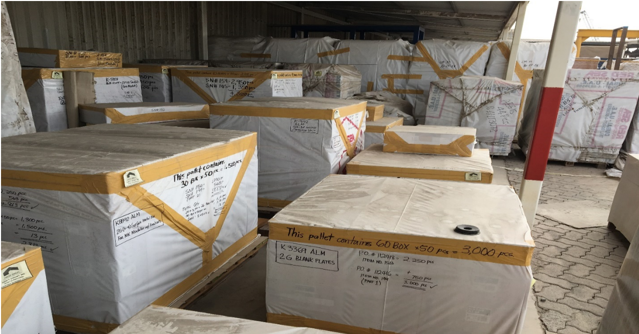
Source: OIG photo of CHU building materials taken in Dubai, U.A.E. on February 22, 2018.

Physical and Technical Security – The Department modified the Aegis task order in September 2015 to incorporate technical security upgrades that were not included in the original award. These changes came roughly one year after award and two months before Aegis submitted the 100 percent design. CWI claimed that the upgrades made material changes to the scope of the work and therefore adversely affected the schedule for completion. AQM disagreed with this assessment, asserting that the changes were relatively small and that the modifications should not affect the cost or schedule of the project. Separately, according to multiple Department officials, the deteriorating security situation in Kabul at the time caused DS to seek several other physical security upgrades to the Camp Eggers design in early 2016. These changes caused further delay, and the disagreement with Aegis regarding the consequences of these changes was never resolved before work was suspended.