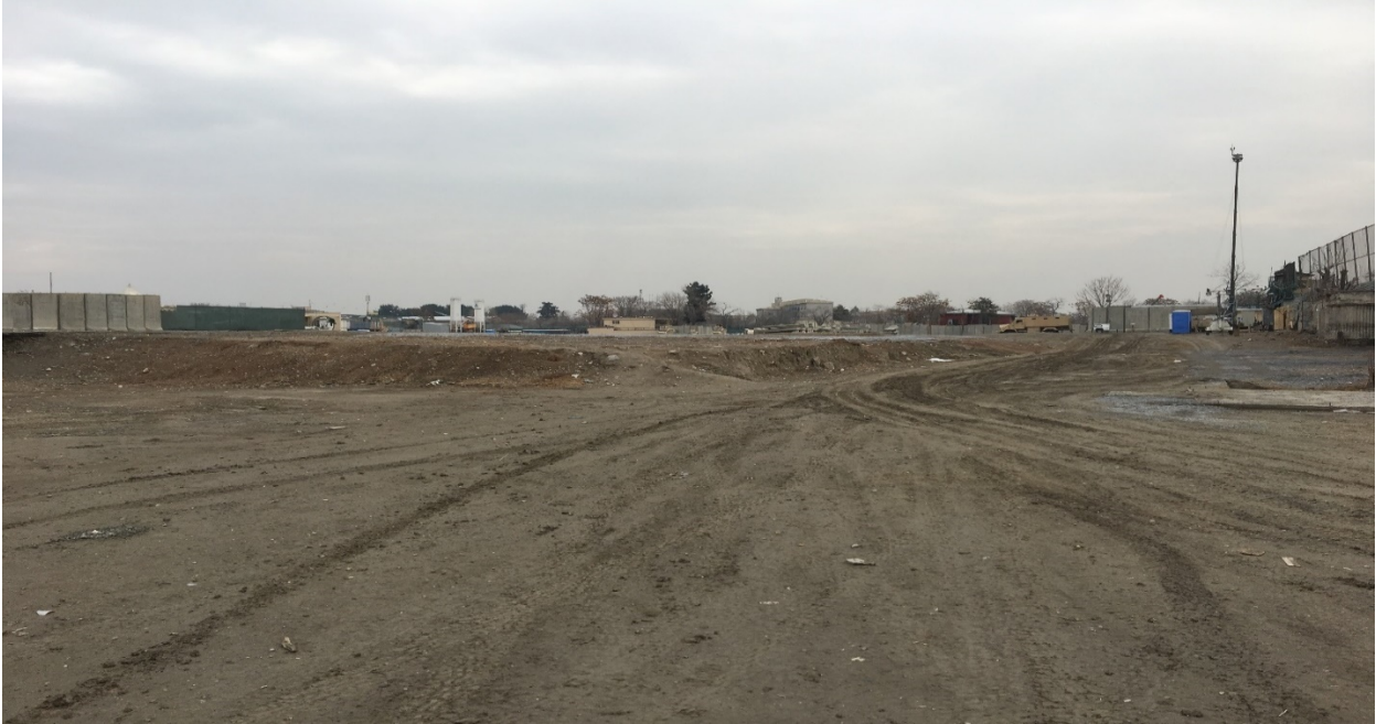
of Camp Eggers taken February 26, 2018.