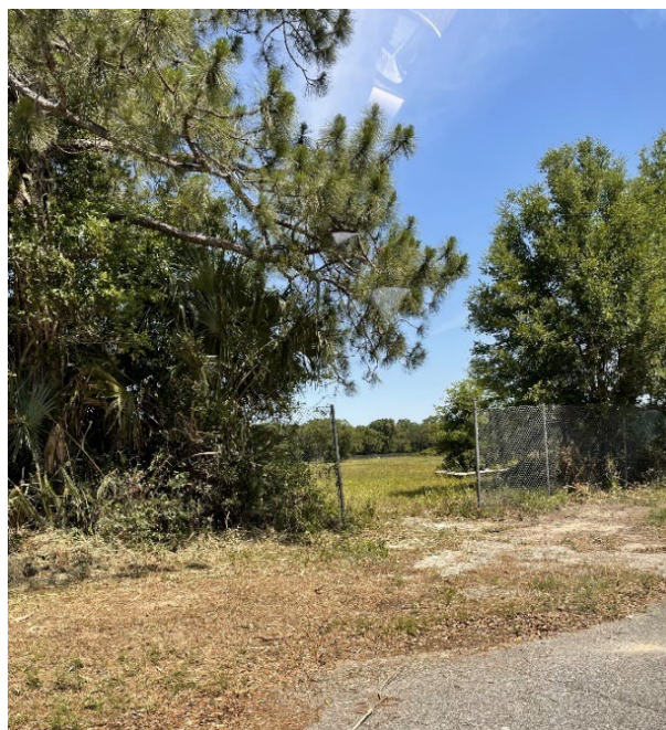
From left to right: Locked gate with a gap large enough to enter the site. Portion of fence missing at the site.

The O&M Plan also specifies that O&M activities include monitoring zoning changes to ensure that they comply with institutional controls. However, the zoning in the northern half of the Escambia Wood Superfund site conflicts with the restrictive covenants established in 2013. Specifically, some parcels of