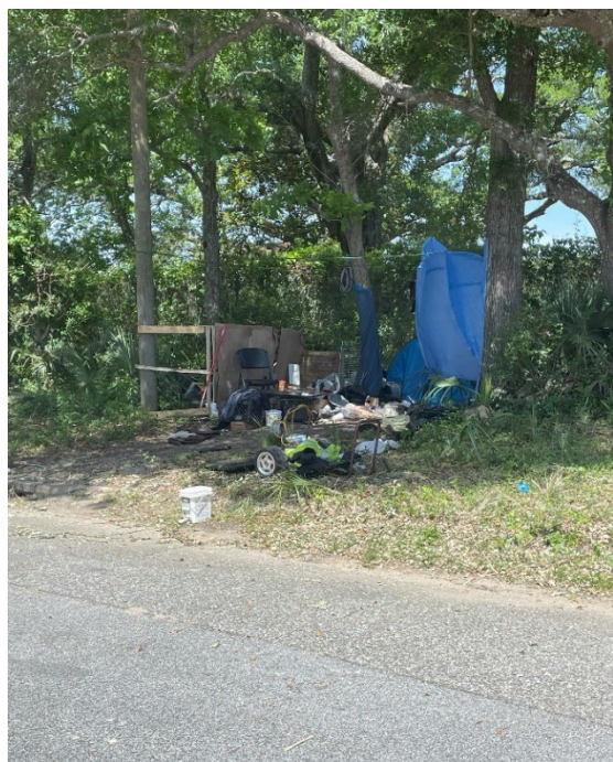
Encampment observed at the Escambia Wood Superfund site.