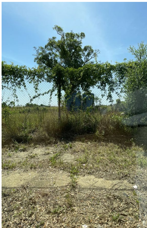
Fence overgrown with vegetation. The vegetation is also covering a faded sign meant to warn the public about contaminated soil and groundwater at the site.