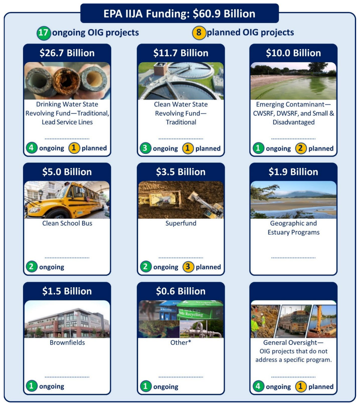
Figure A-1: Distribution of the OIG's Oversight Projects Across the EPA's IIJA-Related Programs