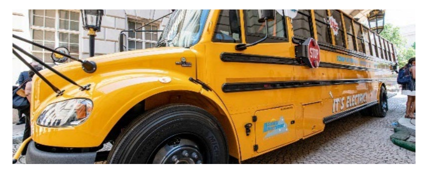
Electric school bus.

The management implication <u>report</u> outlined our concerns that the EPA's lack of verification mechanisms within the Clean School Bus Program's rebate and grant application process increases risk for fraud, waste, and abuse. We reviewed the 2022 Clean School Bus rebate program and found that program data contained potentially inaccurate information. We also identified one instance in which an entity without any students applied for and received funding, jeopardizing the program's principle of equitable resource distribution. The failure to require a truthfulness attestation and the lack of a verification process places funds at risk. We outlined six measures for improvement that the EPA could take to help prevent potential fraud and establish a process for assessing applicant disclosures. These included requiring applicants to provide supporting documentation, establishing a validation regimen, requiring recipients to maintain a documentation archive, highlighting criminal penalties and requiring signed certifications, requiring notarized attestations and certifications, and increasing oversight of third-party vendors. By implementing these measures, the EPA will bolster the efficacy of federal award administration, enhance the authenticity of award applications, and elevate the integrity of the Clean School Bus Program.