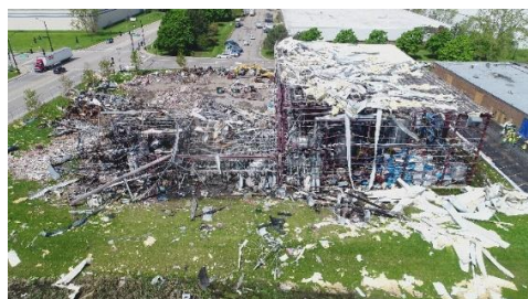
The CSB investigated an explosion and fire at the AB Specialty Silicones facility in Waukegan, Illinois.

The CSB is an independent federal agency that is responsible for investigating industrial chemical accidents at fixed industrial facilities to determine the conditions and circumstances that led to the accidents, so that similar events