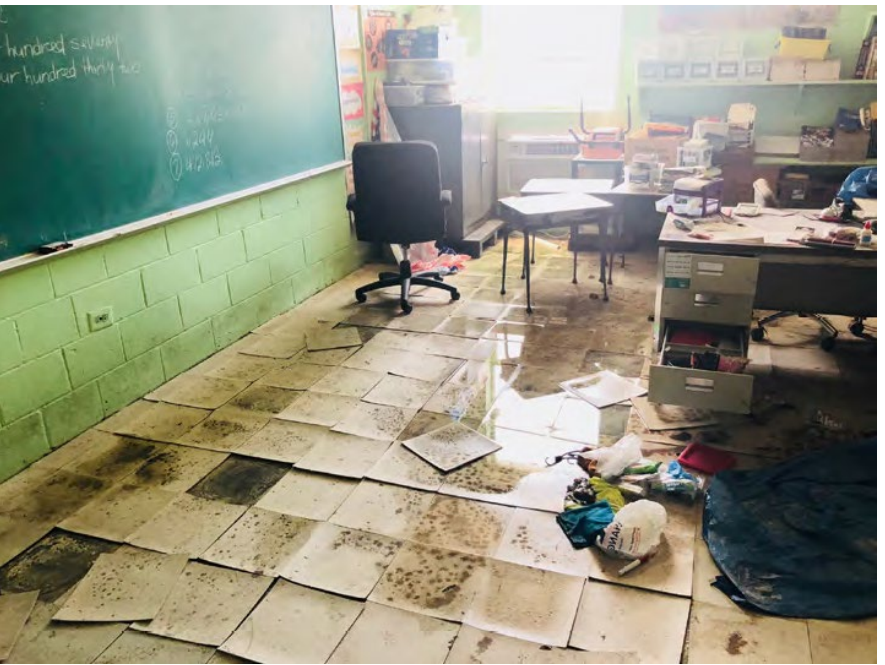
Figure 1. Alexander Henderson Elementary School in St. Croix

In September 2017, the U.S. Virgin Islands was impacted by Hurricanes Irma and Maria. Prior to Hurricanes Irma and Maria, the Territory had 27 public schools with over 13,000 enrolled students. According to the Virgin Islands DOE, Hurricanes Irma and Maria destroyed 12 of those schools, which enrolled 3,878 students. The pictures below, taken by U.S. Department of Education Office of Inspector General staff during a visit to the U.S. Virgin Islands in May 2018, show the Hurricanes' impact on classrooms from 2 of the 12 schools that were destroyed.