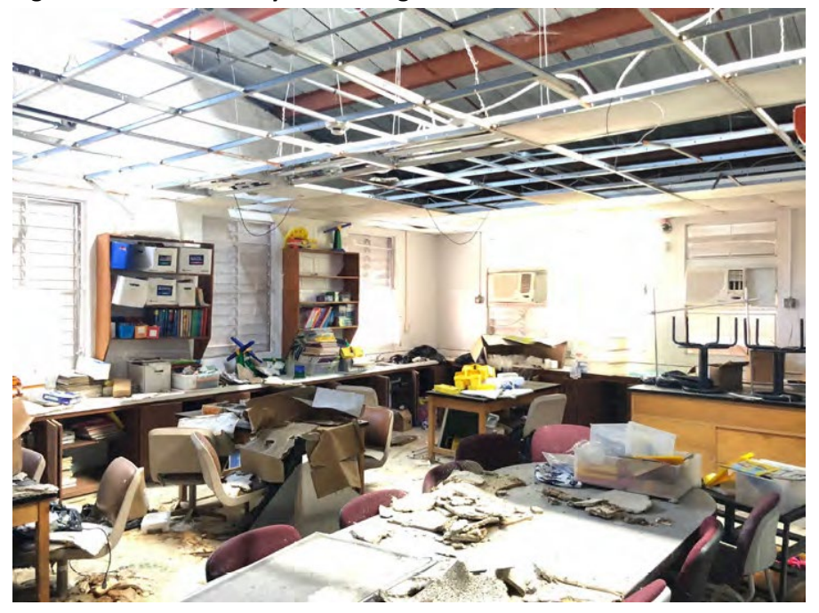
THE CEILING IN A CLASSROOM IS EXPOSED AND FURNITURE AND EDUCATIONAL MATERIALS ARE DESTROYED AFTER WIND AND WATER DAMAGE FROM HURRICANES IRMA AND MARIA.

Figure 2. Addelita Cancryn Junior High School in St. Thomas