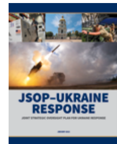
Joint Strategic Oversight Plan for Ukraine Response, January 2023.

As of March 15, 2023, oversight agencies that participate in the Working Group had issued 17 reports. (See Appendix A.) The Working Group’s participating organizations had 71 ongoing and planned projects related to Ukraine response efforts, a number that continues