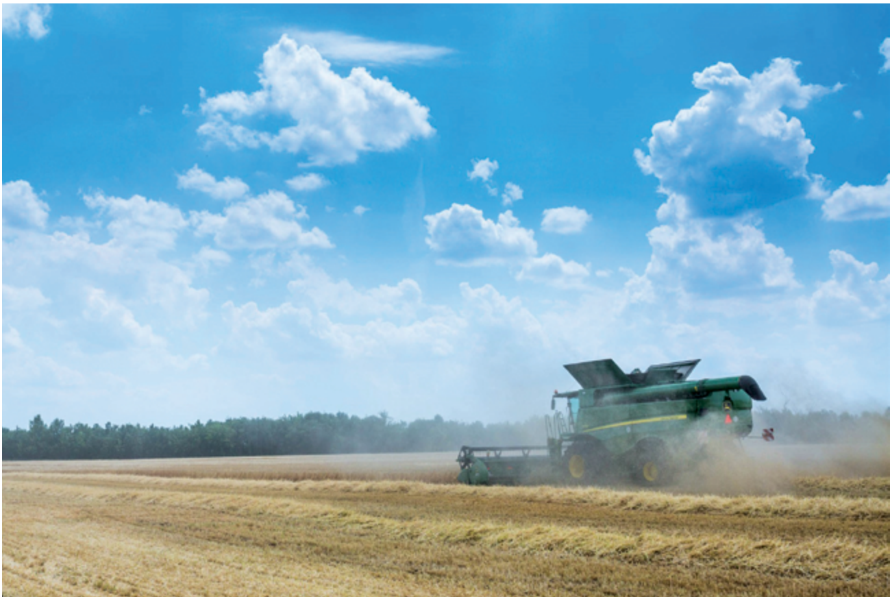
A farmer harvests crops in rural Ukraine during the 2022 harvest season.