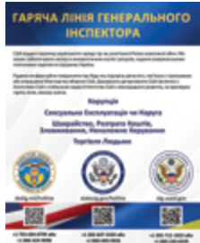
Ukrainian language version of the joint hotline poster.