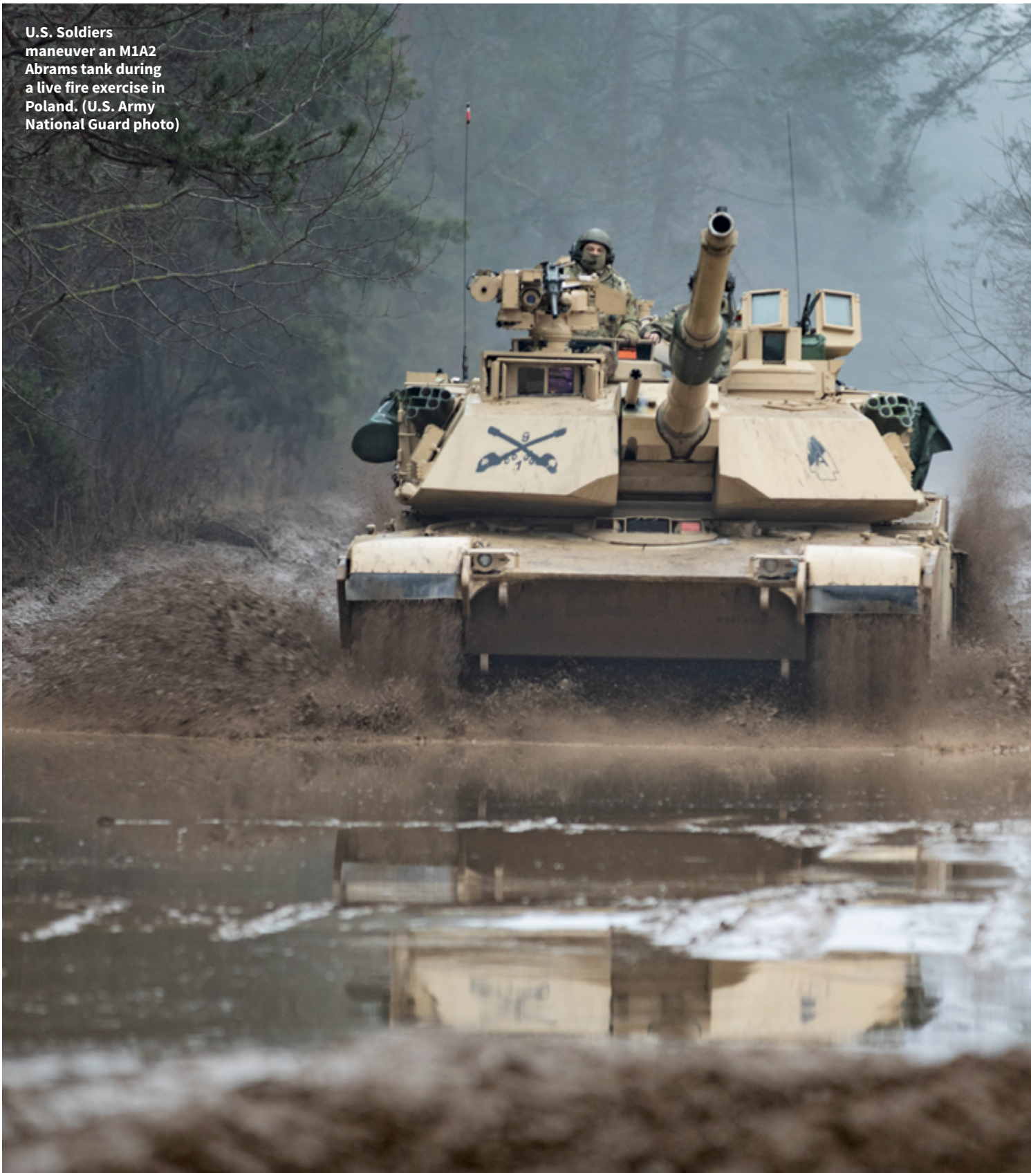
U.S. Soldiers maneuver an M1A2 Abrams tank during a live fire exercise in Poland.