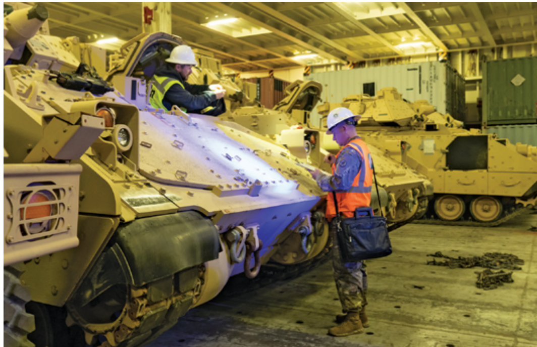
U.S. Army Transportation Battalion personnel prepare a Bradley Fighting Vehicle for overseas transport to Ukraine.

expanding on its previously published reports about the DoD's EUM and EEUM program and procedures. The DoD OIG will continue to evaluate the DoD's EUM and EEUM of sensitive military equipment provided to Ukraine to ensure equipment accountability is in compliance with DoD policy for as long as the conflict and the need for oversight of such assistance continue. (For more information regarding oversight of EUM and EEUM, see page 15.)