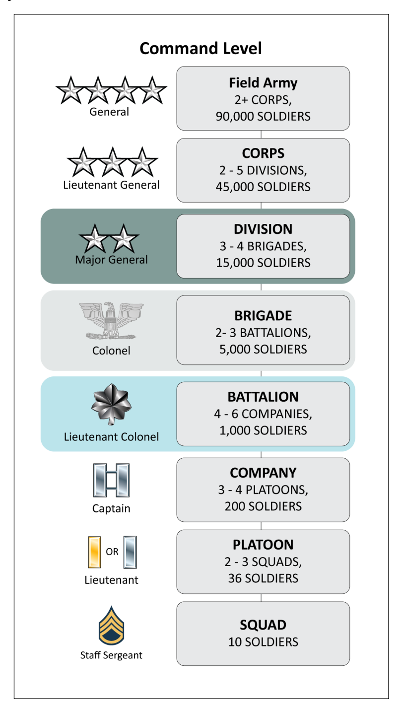
Figure 2. Army Command Structure

Army command structure includes a corps, followed by division, and within each division are at least three brigades. Figure 2 shows the Army command structure, and the relationship between battalions, brigades, and divisions.