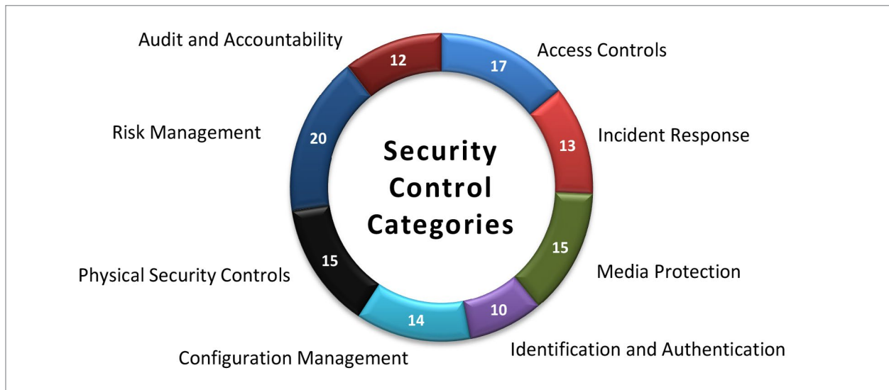
Figure. Recommendations by Security Control Category

In the five audit reports we discuss in this special report, we made 116 recommendations to DoD Components related to DoD contractor cybersecurity weaknesses. The following Figure shows the number of recommendations by security control category.