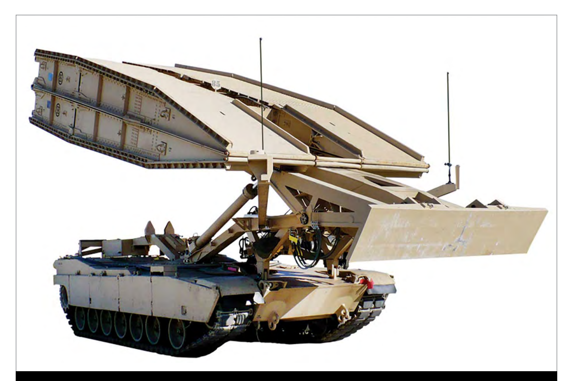
Figure 3. The Joint Assault Bridge

The JAB, shown in Figure 3, is an M1 Abrams tank integrated with heavy suspension and a hydraulic bridge launching system, which provides the Army with the capability to cross wet or dry gaps and allows maneuverability on the battlefield. Project Manager Force Projection (PM Force Projection) manages the JAB. PM Force Projection falls under PEO Combat Support and Combat Service Support. The Army has both a workshare and direct sale P3 with Leonardo DRS.