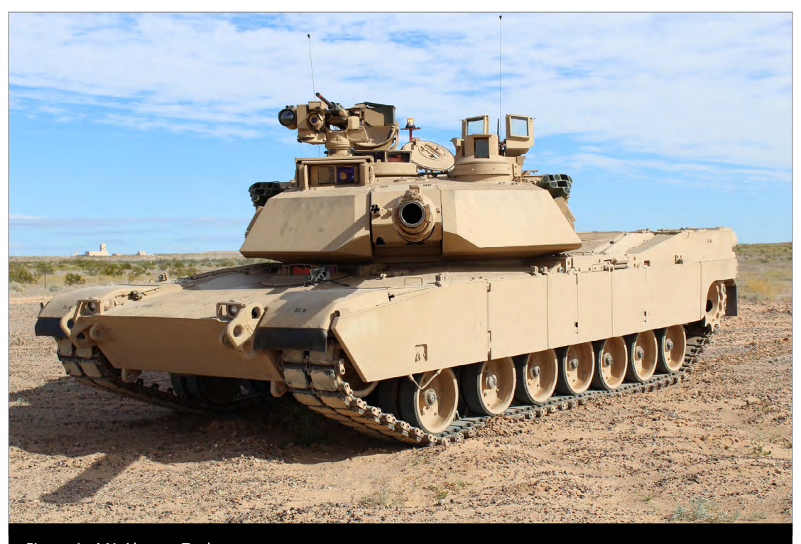
Figure 1. M1 Abrams Tank

The M1 Abrams, shown in Figure 1, is a fully tracked, low profile, land-combat assault weapon managed by Project Manager Main Battle Tank Systems (PM Main Battle Tank). PM Main Battle Tank falls within Program Executive Office (PEO) Ground Combat Systems. The M1 Abrams fleet consists of two variants — the M1A1 and the M1A2. The Army has a workshare P3 with General Dynamics Land Systems (GDLS) to upgrade the M1 Abrams and a workshare P3 with Honeywell International, Inc. (Honeywell) to provide support for the M1 Abrams tank engine, through the TIGER program.