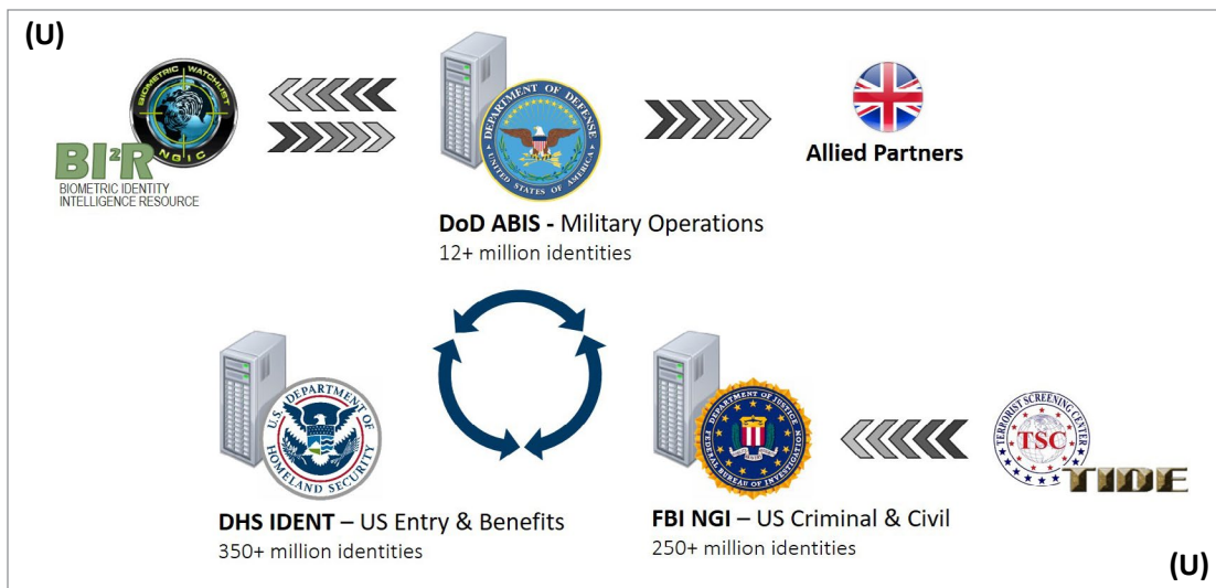
(U) Figure 2. Interagency Biometrics Database Enterprise

(U) Through ABIS, DFSC/BOD coordinates, integrates, and synchronizes support for the operational use of biometrics to other U.S. Government agencies that maintain their own biometric-enabled watch lists to support national security screening and vetting activities. The DHS uses the Automated Biometric Identification System (referred to as “IDENT”) to centrally store and process biometric and associated biographic data used by DHS organizations, such as CBP and U.S. Citizenship and Immigration Services (USCIS). The Department of Justice uses its Next Generation Identification system for this same purpose. The DoD’s sharing of ABIS biometric files with the DHS Management Directorate Office of Biometric Identity Management’s IDENT and the Department of Justice’s Next Generation Identification system enables biometric and biographic comparison to BEWL data across agencies. See Figure 2 for an illustration of the three agencies’ biometrics databases.