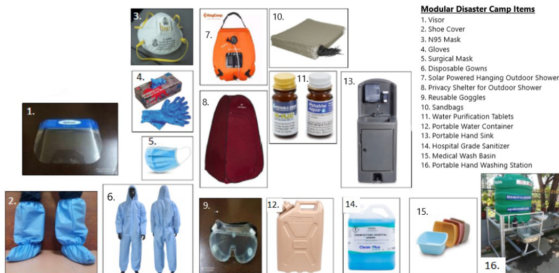
Figure 1. Modular Disaster Camp Items Donated to Nepal