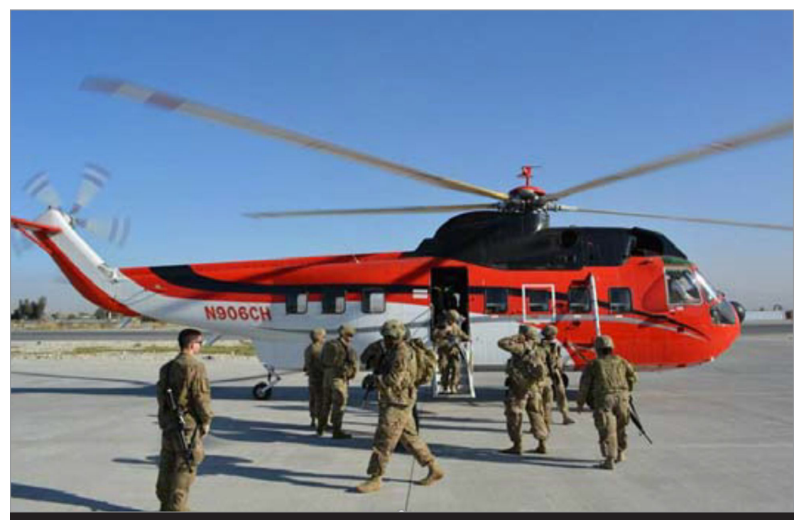
Figure 1. Helicopter Used for Contracted Air Transportation Services