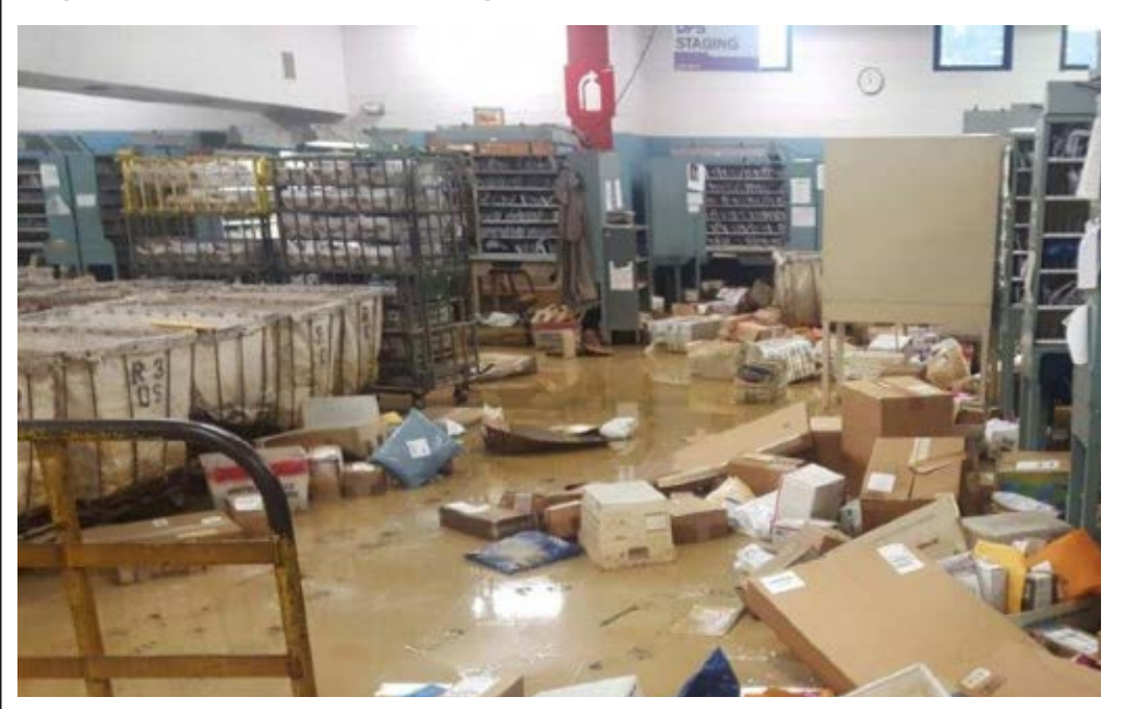
Figure 4. Denham Springs Post Office — Flooded Workroom Floor

Denham Springs, LA, August 2016. Provided to the OIG by Postal Service management on December 1, 2016.