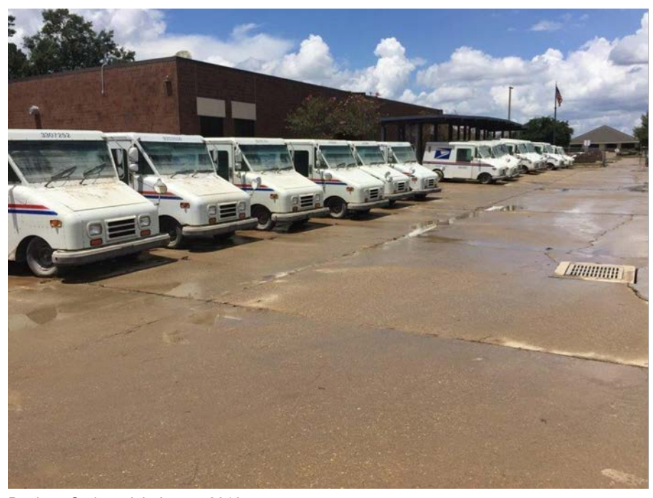
Figure 1. Water Line Visible on Windshields of Long Life Vehicles

Denham Springs, LA, August 2016. Provided to the U.S. Postal Service Office of Inspector General (OIG) by Postal Service management on December 1, 2016.