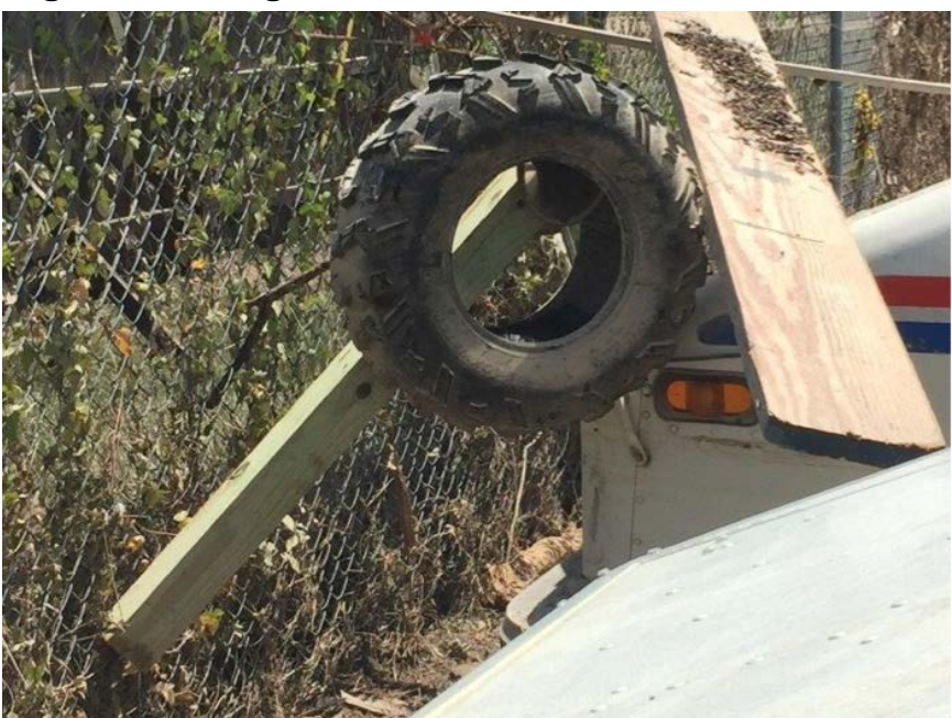
Figure 2. Long Life Vehicles with Tire and Board on Mirror

Denham Springs, LA, August 2016. Provided to the OIG by Postal Service management on December 1, 2016.