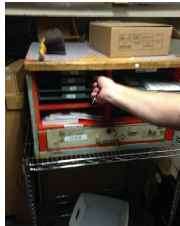
taken on April 13, 2016.