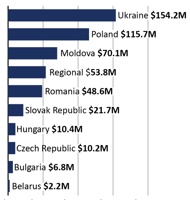
FIGURE 3: FUNDING OBLIGATED BY COUNTRY

Of the $493.7 million obligated for humanitarian assistance in response to the Ukrainian crisis, $415.2 million (84 percent) had been expended as of February 2023 in nine countries: Ukraine, Poland, Moldova, Romania, Slovak Republic, Hungary, Czech Republic, Bulgaria, and Belarus. Figure 3 shows the amount of funds obligated by country.