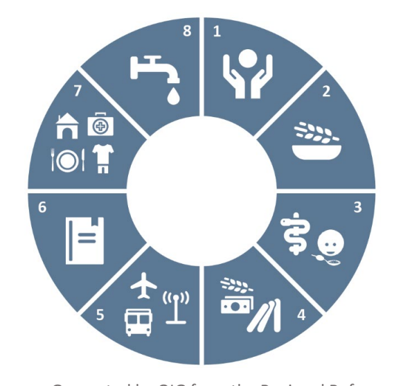
Figure 2: AREAS OF ASSISTANCE

PRM's implementing partners are working across eight areas of assistance: (1) protection; (2) food security; (3) health and nutrition; (4) livelihood and resilience; (5) logistics, telecommunication, and operational support; (6) education; (7) basic needs; and (8) water, sanitation, and hygiene.