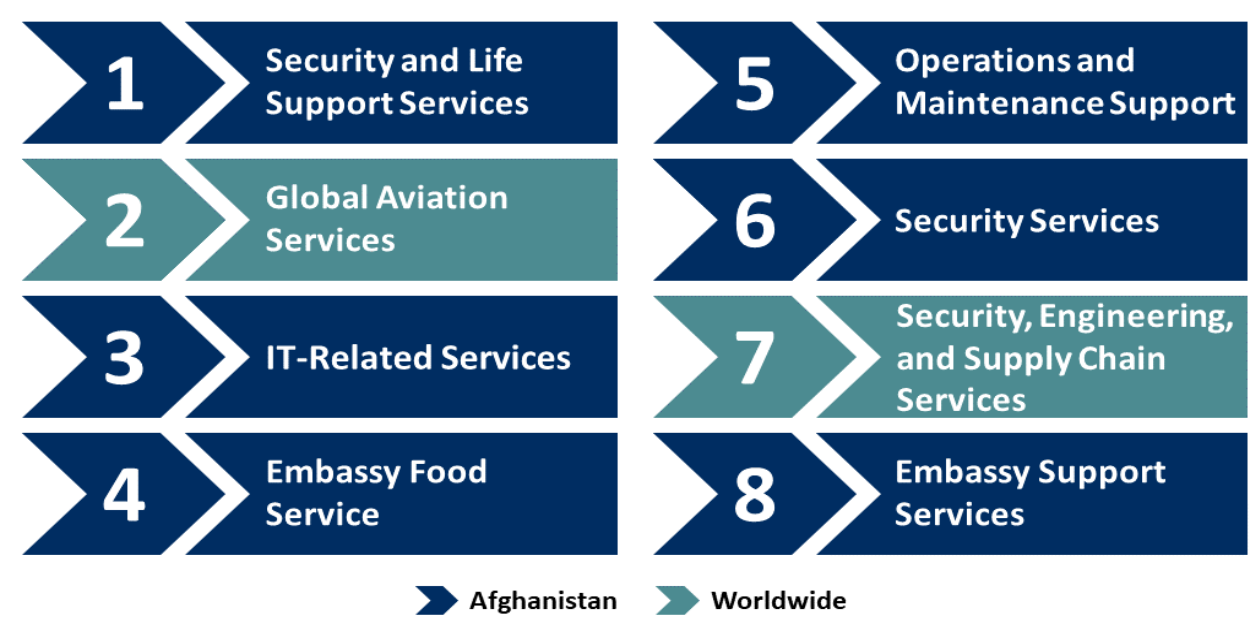
Figure 2: Contracts Selected for OIG Review

OIG selected eight awards for review.<sup>68</sup> Figure 2 provides a description of the selected contracts and details on whether each contract was Afghanistan-specific or worldwide.