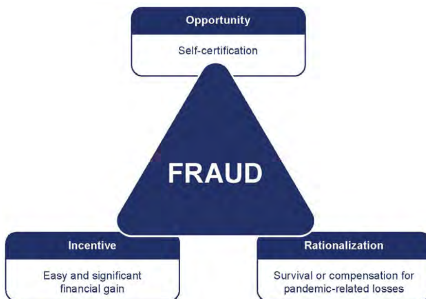
Figure: Fraud Triangle for the PUA Program