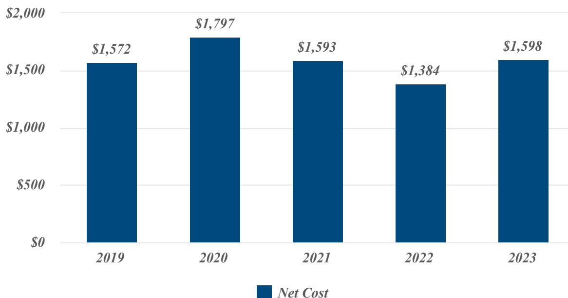
Figure 1 - AFF Net Cost (Dollars in Millions)