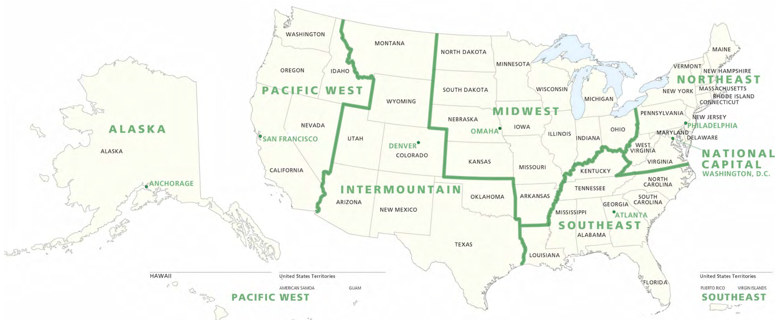
Figure 1: Map of Legacy NPS Regions

According to NPS officials, the Washington Support Office (WASO) provides the central management for national programs, policy, and budget. NPS explained that WASO's leadership includes the NPS Director and three deputy directors: one for operations, one for congressional and external relations, and one for management and administration. These deputy directors are supported by a comptroller, associate directors, and assistant directors. Officials under the WASO Deputy Director for Management and Administration are responsible for allocating and overseeing IRA funding and hiring employees. NPS officials further stated that the seven regional directors responsible for managing the park units in their respective regions report to the Deputy Director for Operations; however, those regional directors are not considered part of WASO. Figure 2 on the next page shows NPS' organizational structure relevant to our report scope.