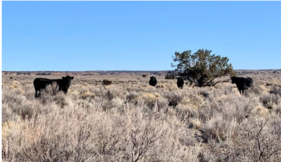
Figure 1: Cattle Grazing on the Padres Mesa Demonstration Ranch's Sustainable Rangeland