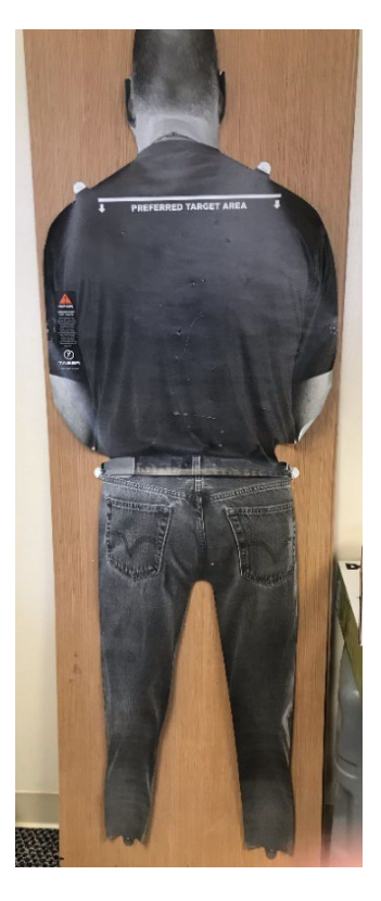
Figure 5: Target Used for Static Taser Training Deployments

While the DOI's interim taser policy has requirements to include scenario-based training and hands-on control tactics,<sup>25</sup> it does not explicitly establish minimum requirements for each recertification topic or address how to handle situations involving high-risk individuals, such as