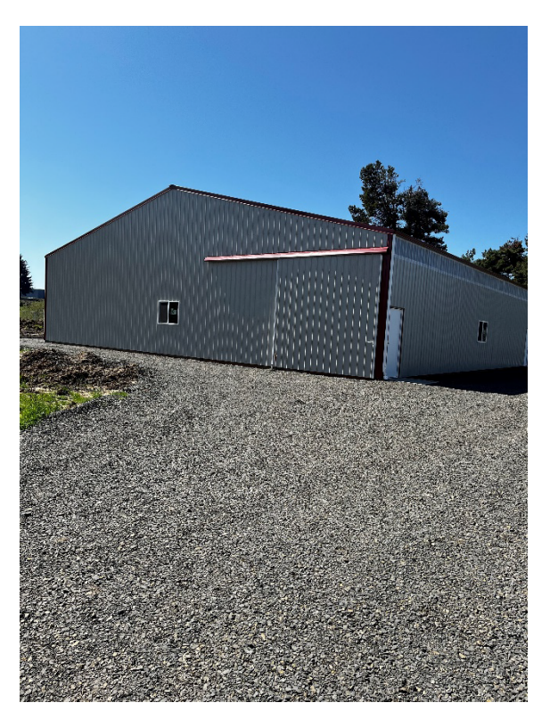
Figure 4: Pole Barn Constructed Without Approval