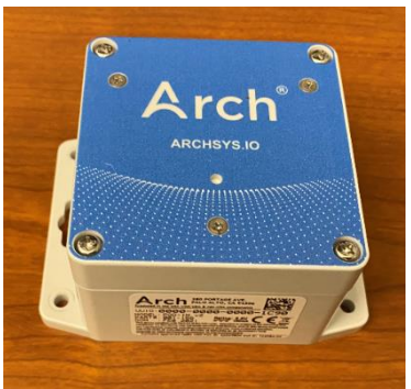
PROVIDED BY SNL MANAGEMENT

FIGURE 1. PHOTOGRAPH OF BLUETOOTH DEVICE